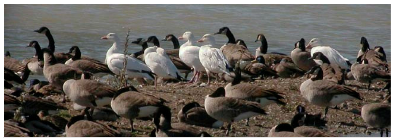
A group of 5 Snow Geese found by Stan Long on 19 October was the highest count so far for the Reesor Pond, York , which has proven to be an important stopover site for migrating geese since it was built in 2005.

SNOW GOOSE - 2 at Cranberry Marsh [DU] on 3<sup>rd</sup> & 8<sup>th</sup> (JDL fide DRBA) & 1 there on 10<sup>th</sup> (CMRW fide JDL, fide ONTBIRDS). 1 at The Willows, Dundas Marsh [HW] on 9<sup>th</sup>, 3 at Bronte Harbour [HL] on 11<sup>th</sup> (anon fide CEdge, fide ONTBIRDS), 1 at N of Stouffville [YO] on 15<sup>th</sup> (Al Johnson fide RJF, fide ONTBIRDS) & 1 (white) at Warden, N of Major Mack [YO] on 17<sup>th</sup> (RJF fide ONTBIRDS) & 21<sup>st</sup> (RBHS,WP). 5 (white) were first reported at Reesor Road Ponds [YO] @ 12:00hrs on 20<sup>th</sup> (SLo fide ONTBIRDS) and the 5 or a number of them were subsequently seen there or in the nearby fields where they would go off to feed with the Canada Geese on most days until the end of the month (m. obs.)