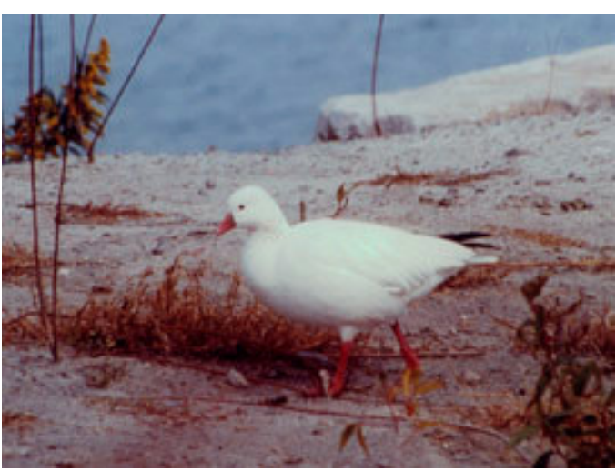
7 November 1999 , Humber Bay Park East, Toronto.

■ 1999 Humber Bay Park must have some special attraction for migrant Ross's Geese, because one was again found there on 5 November. initially in the eastern section. Occasionally it went to feed on the grass lawn of Christie's bakery on north side of Lakeshore Road and on the lawns interspersed along the motel strip. It is possible that this bird first turned up on 4 November, because a late report from Bob Yukich mentioned that at about 12:00h on that date he had distant views of a small white goose landing with Canada Geese at the mouth of the Mimico Creek. This bird stayed to 3 December and because of its long stay it was seen by dozens of birders and photographed by many. The database records at least 19 observers who were known to have seen and/or reported it. Glenn Coady obtained two minutes of video at Sunnyside on the 6<sup>th</sup>, and was apparently the last person to see it on the morning of 3 December. OBRC accepted "one,