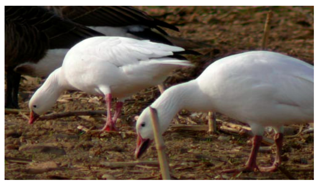
Adult Ross's Goose (left) foraging with a Snow Goose on 22 October 2007, Reesor Pond, York.