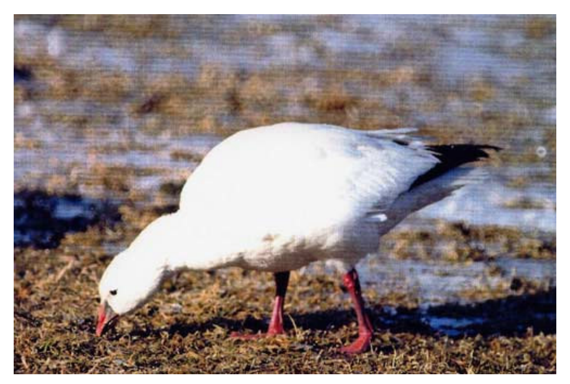
The Ross's Goose was last seen on 16 March 1997 at Superior Avenue, near Humber Bay West, Toronto.