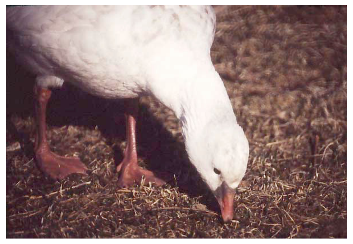
Ross's Goose on 15 March 1997, Humber Bay Park West, Toronto.