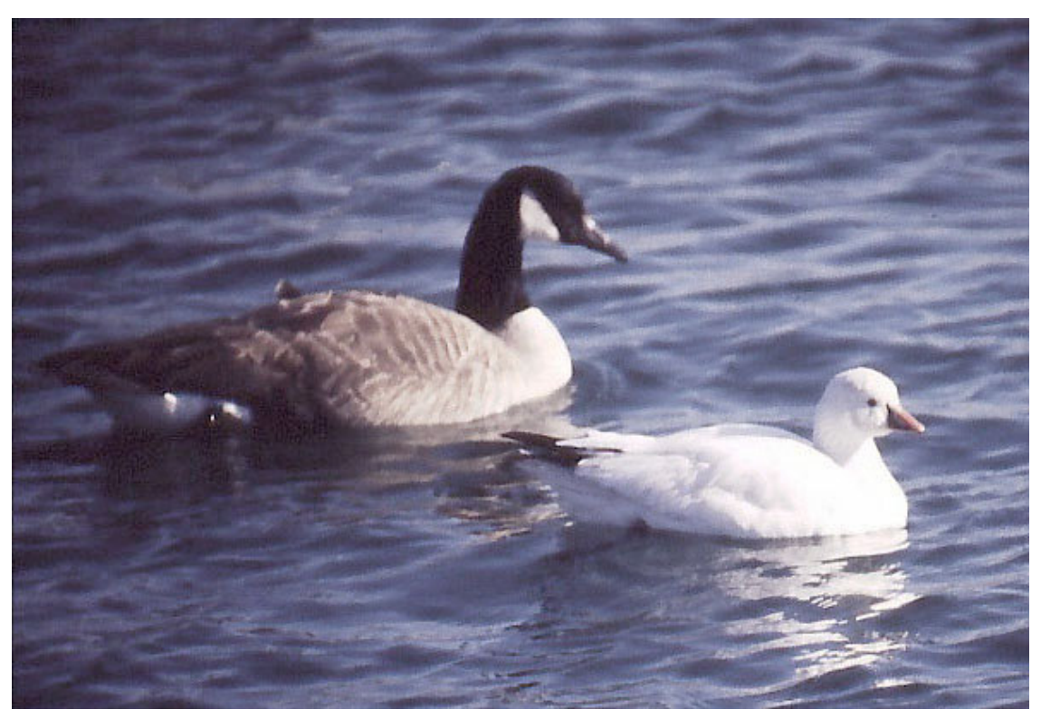
Ross's Goose (right) and Canada Goose on \bf 15 March \bf 1997 , Humber Bay Park West, \it Toronto. \it