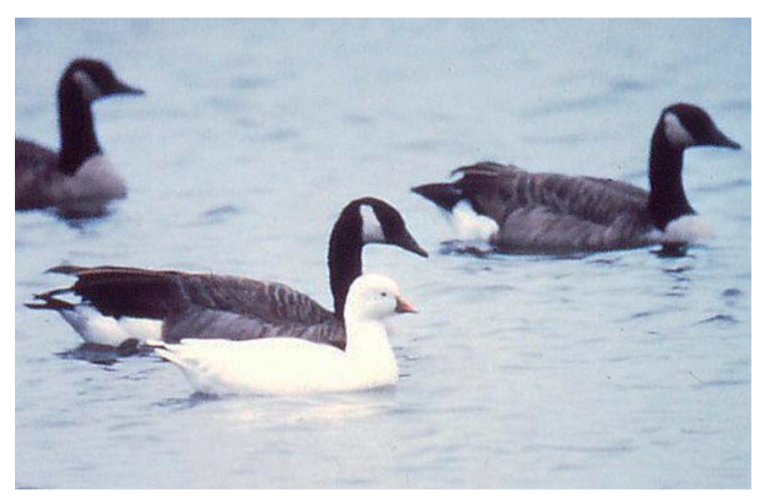
17 September 1987 , Cedar Estate ponds, Simcoe County. This is very likely the same individual seen at Cranberry Marsh 1 October – 1 December 1987.

• 1987 The first report of a Ross's Goose in the GTA involved an adult which was found in the Halls Road/Cranberry Marsh area of Durham R.M. on 1 October 1987 (Jaramillo 1990). It remained in that area through October and November until the last sighting on 1 December (m. obs). The OBRC report for 1989 suggested that this was the same bird which had been originally found at the Cedar Estate ponds near Bass Lake, Simcoe Co. on the remarkably early date of 30 August 1987, and since that one had turned up in a "waterfowl park", among Canada Geese, and where a Barnacle Goose was also present, its origin was considered questionable (Wormington and Curry 1990). The following dates were provided for the Simcoe bird: 30 August -20 September - Bass Lake; 20 September - Matchedash Bay; and 23 September – Bass Lake (again). This Ross's Goose turned up at Cranberry Marsh in the presence of two identifiable neck-banded Canada Geese from James Bay that it had associated with earlier at the Simcoe County site. It should also be noted that this bird (or another?) then moved on to the Niagara area where it was reported from St. Catharines from 27 January – 12 February 1988. Again, there seems to have been an assumption that the same bird was involved? Although OBRC rejected this series of reports, today with the benefit of hindsight, a case might be made for re-evaluation?