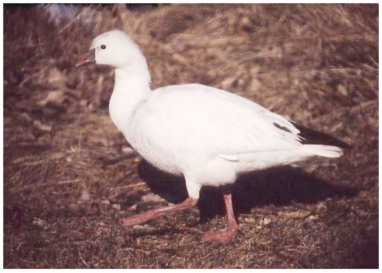
Ross's Goose on 15 March 1997 , Humber Bay Park West, Toronto . Note the sparse dusky marks on the head and mantle, and a few larger dark spots at the left side of the neck indicating that it was an immature white morph bird.