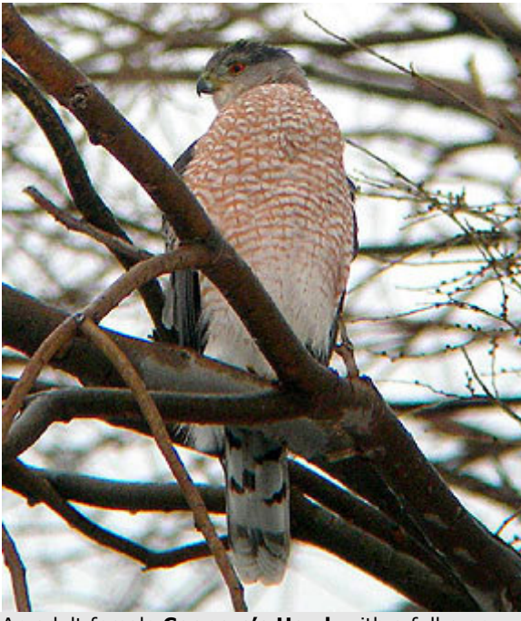
An adult female Coopers's Hawk with a full crop, having just raided a feeder and consumed her prey; Toronto , 2 December 2007.