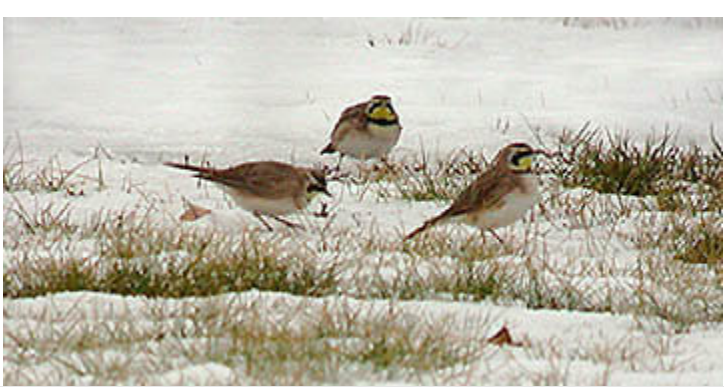
Three of nine Horned Larks at Beechwood Cemetery, York , on the Toronto CBC. 23 December 2007.