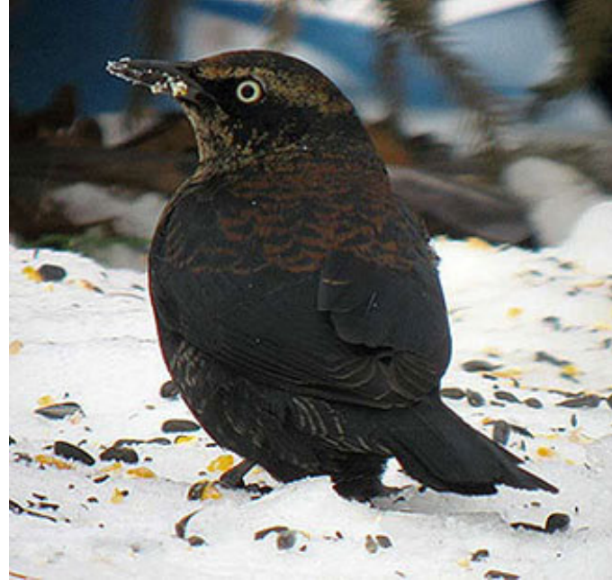
Rusty Blackbirds occasionally linger into the winter; this bird was found at Pine Hills Cemetery, Toronto, 24 December 2007.