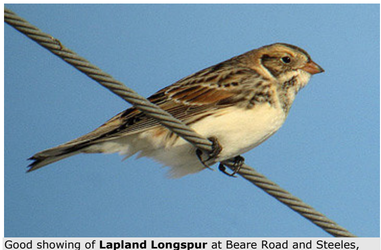
Good showing of Lapland Longspur at Beare Road and Steeles, Toronto , 8 December 2007.