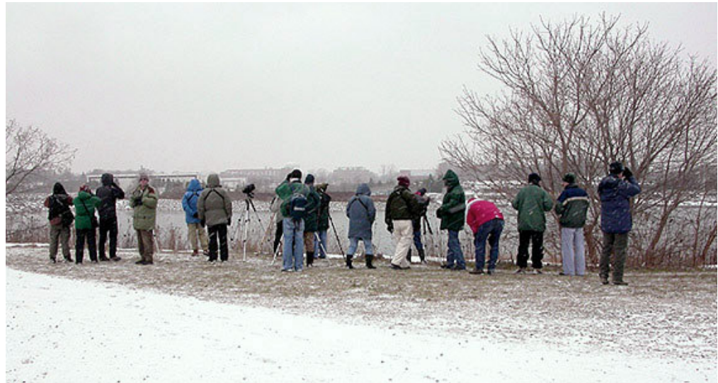
OFO group Winter Birding at Colonel Samuel Smith Park, Toronto, 9 December 2007.

Names in ITALICS indicate subspecies, hybrids, morphs or other 'recognizable forms', which may be identifiable in the field. This does not necessarily imply that the compilers agree with such designations, or accept their validity.