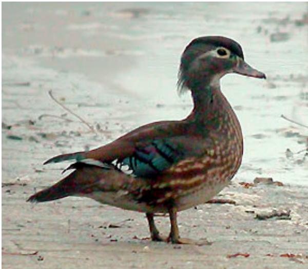
A female Wood Duck waiting for bread crumbs at the Ashbridge's Bay Park, Toronto , 6 January 2008; it probably had been around for some time.

WOOD DUCK - 1 F at Ashbridge's Bay Park on 5 th (DP), 6 th (RBHS,WP,MWWI), on 26 th (NMu,&) & on 27 th (Bob Kortright fide ONTBIRDS). 1 M at LaSalle Park, Halton on 20 th (Michael Veltri fide ONTBIRDS).