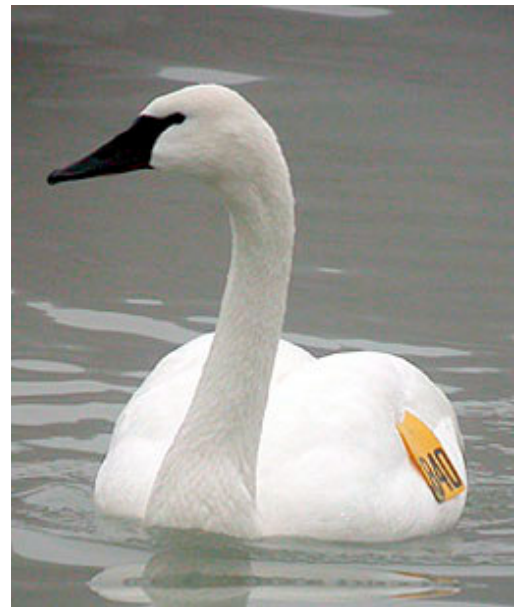
Trumpeter Swan in Bluffers Park, Toronto, 6 January 2008.

TUNDRA SWAN - 3 at Westney Rd & Conc 8, Ajax, Durham on 4 th & 1 at Audley Rd @ L. Ontario, Durham on 6 th (both GCarp fide DRBA).