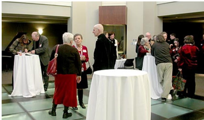
Reception in the Glass Room.