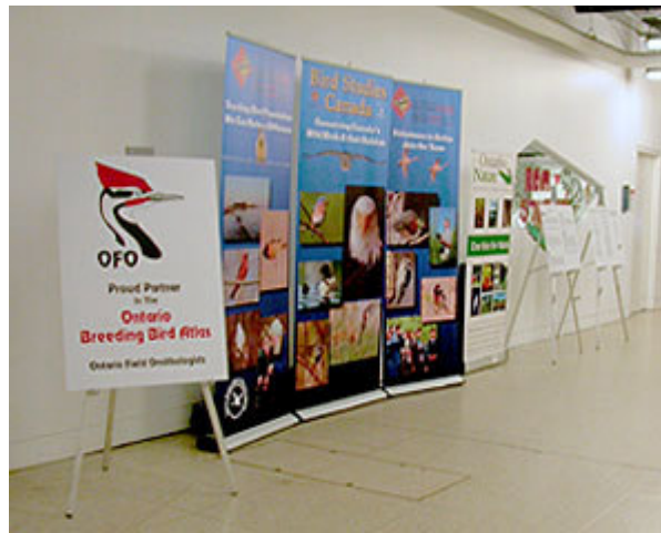
Atlas Publishers: (Left) Ontario Field Ornithologists, Bird Studies Canada, Ontario Nature, Ontario Ministry of Natural Resources, and Environment Canada/Canadian Wildlife Service.