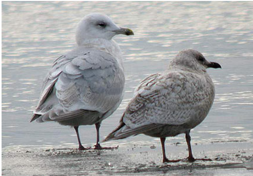
An unusual chance to compare a Nelson's Gull (2nd or 3rd basic Herring x Glaucous hybrid) left, with a Kumlien's Iceland Gull (1 st basic) right. Ashbridges Bay, Toronto, 4 Jan 2008.

HERRING x GLAUCOUS (Nelson's) GULL – 1 2 nd or 3 rd basic, photographed at Ashbridge's Bay Park on 4 th (JI).