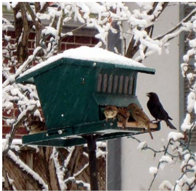
Brown-headed Cowbird at Dacre Crescent, Toronto , 1 January 2008.

BROWN-HEADED COWBIRD - 1 at feeder at #16 Dacre Crescent on 1 st (Attila Fust). 225 at Reesor Road Ponds, York @ 16:15hrs on 13 th (BFe), flying across road, landing and feeding. This will be a new record count for the period 1 Jan to 25 March, [if