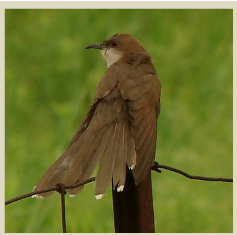
Black-billed Cuckoo drying out after recent rain, Durham , 20 July 2008.