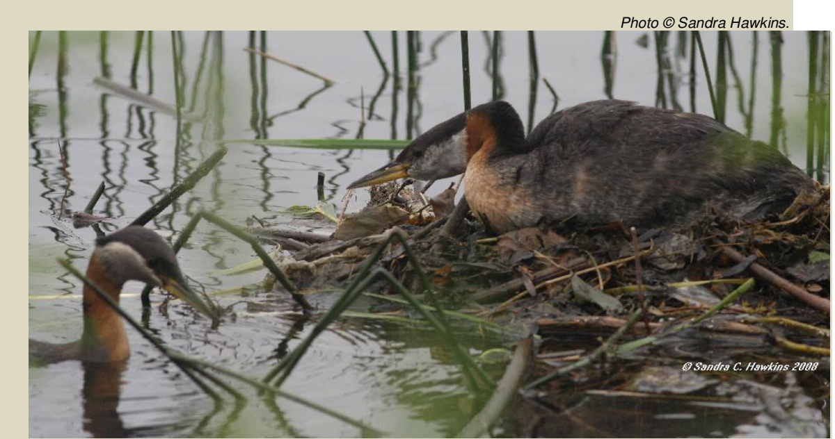
Pair of Red-necked Grebes sharing fresh nesting material; Colonel Samuel Smith Park, Toronto, 11 July 2008.

While well concealed by the adjacent willows, we were privileged to observe some of the Red-necked Grebe's domestic life. Nest maintenance proved to be of paramount importance. The brooding bird was constantly rearranging nesting material and welcomed fresh additions of vegetation that were gathered and delivered to the nest by the non-brooding mate. The pair appeared to be very attentive to each other and maintained visual contact at all times.