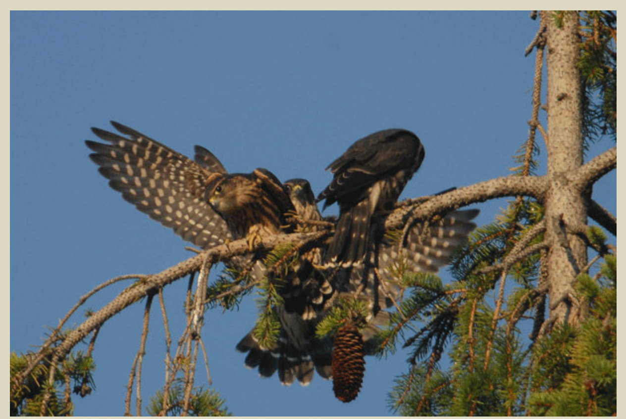
The playful fledged Merlins practising their flying and landing skills at High Street, Whitby, Durham , 25 July 2008.

PEREGRINE FALCON - 3 at King & Bay, Toronto on 18<sup>th</sup> (Glenn Steplock fide ONTBIRDS) were seen soaring near Commerce Court N. 4 (2 AD, 2 FY) at Lift Bridge, Burlington Beach Canal, Halton on 28<sup>th</sup> (anon fide CEdge, fide ONTBIRDS), 2 FY flying around; the other 2 FY have not been seen recently.