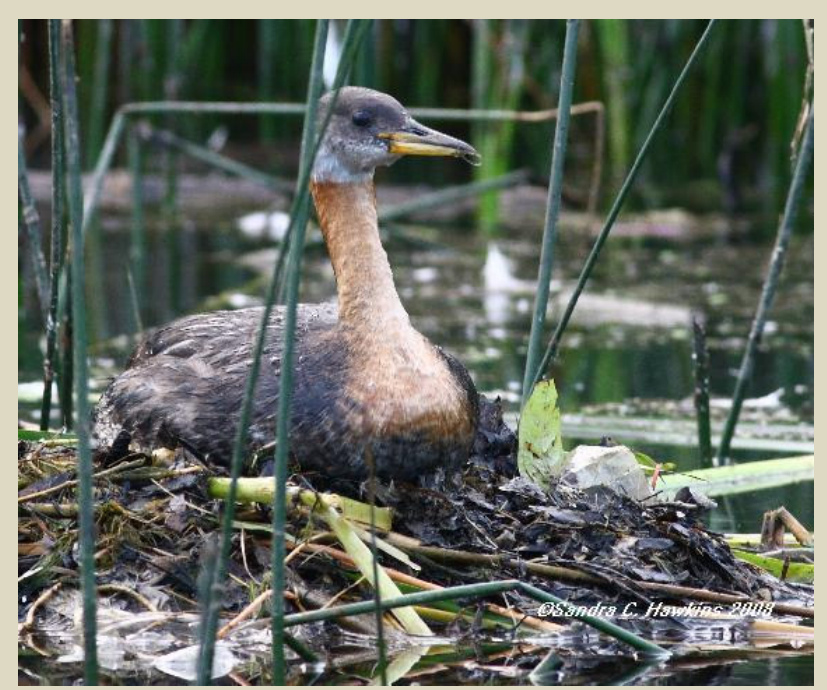
Incubating Red-necked Grebe, Colonel Samuel Smith Park, Toronto, 22 July 2008.

Given this background, a small eastward expansion into the habitat now developing at Colonel Sam Smith Park is perhaps not unexpected. It seems likely that further nesting attempts could occur here in the future. Habitat improvement, such as the provision of floating tires for nesting platforms, as used at Bronte Harbour, could encourage this, and might be an appropriate project for TOC to undertake or promote?