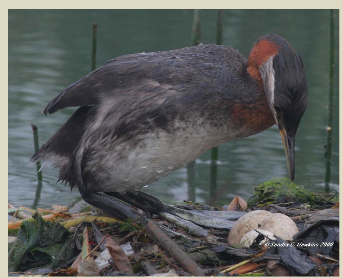
Red-necked Grebe on nest at Colonel Samuel Smith Park, Toronto, 11 July 2008.

The evening of July 11 proved to be most eventful. While photographing a single Red-necked Grebe that was diving just off the southern shore of the marina, we noticed another as it lumbered out of the water and onto a large nest composed of both fresh and decaying reeds. The nest contained three bluish-white eggs. An additional egg floated in the water nearby. The bird methodically checked and turned each egg prior to settling down to brood.