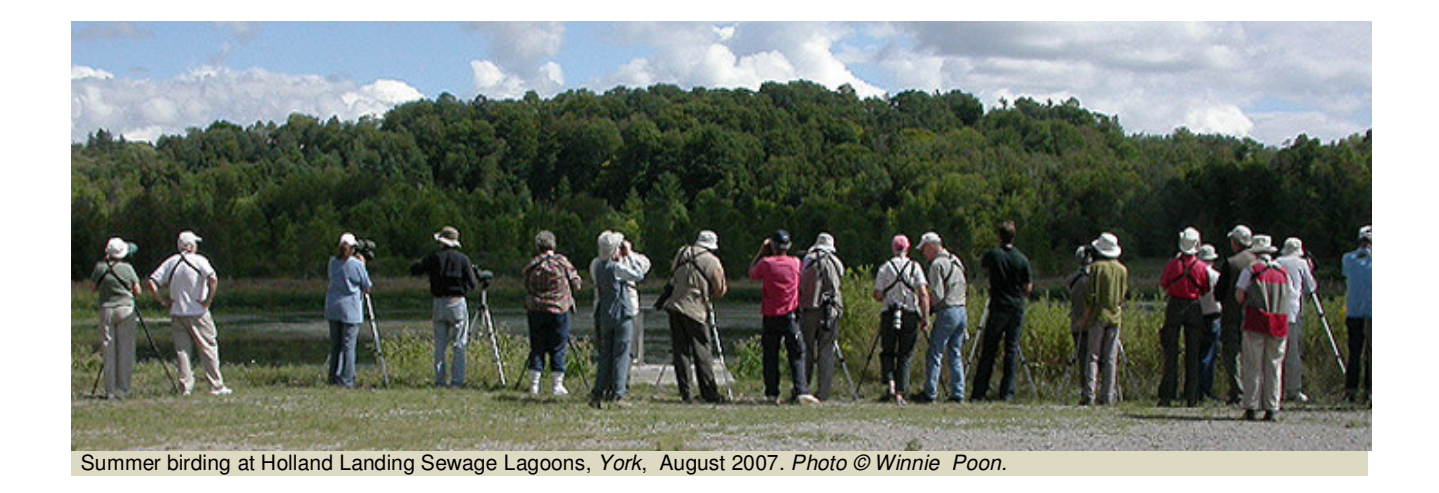
Toronto Birds 2 (7) September 2008

Preferred citation: Worthington, D. 2008. Greater Toronto Area Bird Report: July 2008. Toronto Birds 2(7):125 - 130.