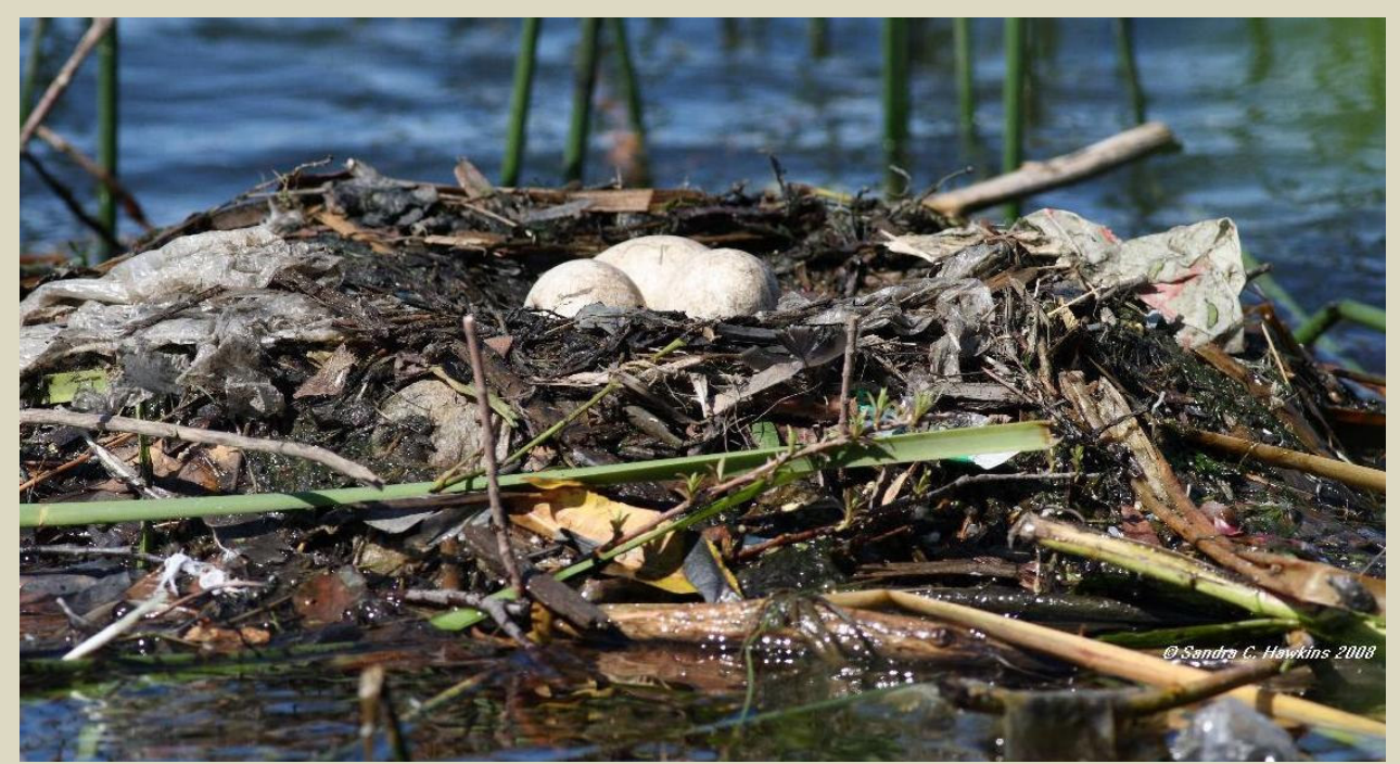
Red-necked Grebe nest with three eggs, Colonel Samuel Smith Park, Toronto, 14 July 2008.