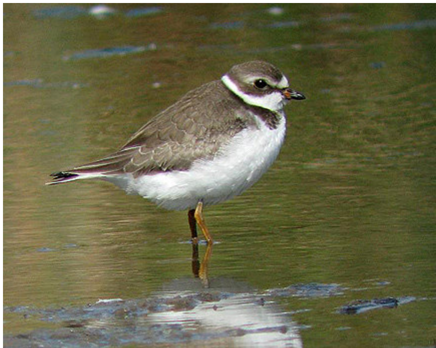
Juvenile Semipalmated Plover at Frenchman's Bay, Pickering, Durham ; September 2008.

KILLDER - 200 at Solina Rd Sod Farms, Durham on 6 th (P. Hogenbirk fide DRBA), 63 on 7 th (GCarp fide ONTBIRDS), 153 on 12 th (THo fide ONTBIRDS) & 47 there on 14 th (RBHS,WP). 21 at Taunton Rd, E of Holt Rd., Durham on 12 th (THo fide ONTBIRDS), 40 at Rattray Marsh, Peel on 13 th (DEP fide ONTBIRDS), 12 at Pringle Creek, Whitby Harbour, Durham on 26 th (RPye fide DRBA) & 12 at LSS on 27 th (GC). 16 at Reesor Road Ponds, York on 20 th (RBHS) & 50 there on 23 rd (SLo fide ONTBIRDS).