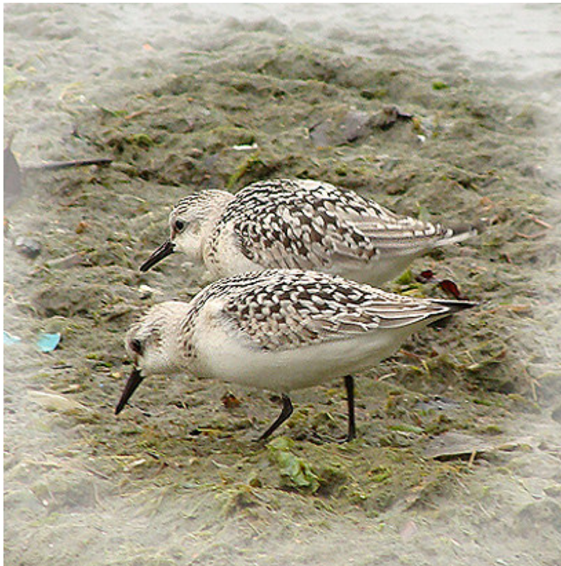
Two juvenile Sanderlings feeding on algae, Ward's Island beach, Toronto Islands, Toronto, 7 September 2008.

SANDERLING - 16 at Ward's Island, TI on 7 th (RBHS,WP,WSLK), 1 at Whitby Harbour, Durham on 23 rd (JDL fide DRBA) & 3 at Darlington Prov. Park, Durham on 30 th (G. Vogg fide DRBA).