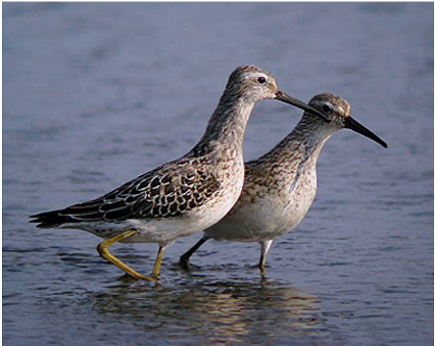
Two Stilt Sandpipers at Frenchman's Bay, Pickering, Durham ; September 2008.

BUFF-BREASTED SANDPIPER - 1 at Solina Rd Sod Farm, Durham on 12 th (THo fide ONTBIRDS).