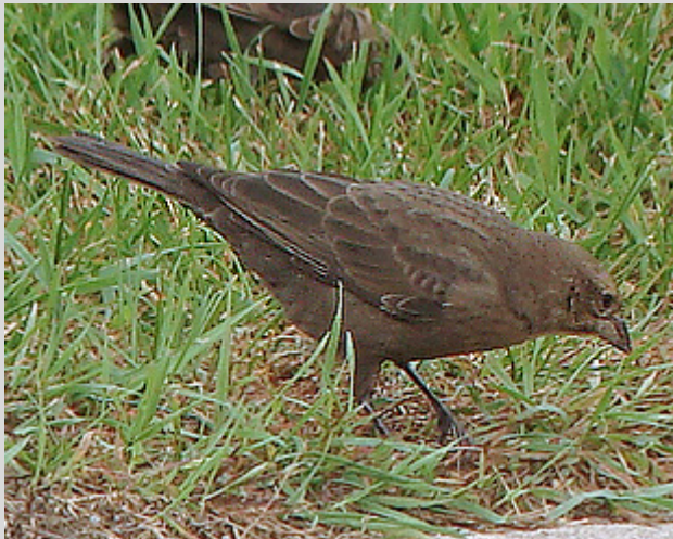
Top left: Two juveniles molting into female plumage.