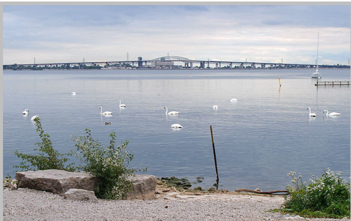
La Salle Park in Burlington, Halton , is the main winter banding site for Trumpeter Swans in southern Ontario.

H.G.Lumsden, 144 Hillview Road, Aurora, Ontario L4G 2M5. Telephone 905-727-6492.