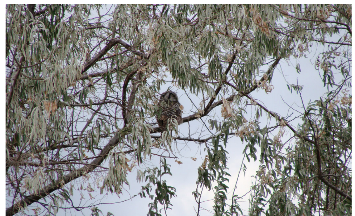
Northern Hawl Owl perched in a roadside Russian Olive at Leslie Street Spit, Toronto, 9 November 2008.