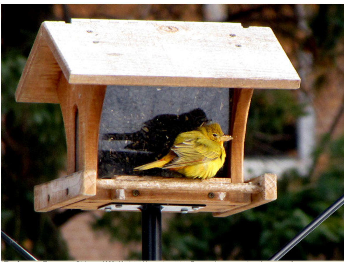
The Summer Tanager at Richmond Hill, York , 22 November 2008. Traces of orange-red on the uppertail coverts, vent, and particularly the edge of a single primary, confirmed that the bird was a first-winter male.