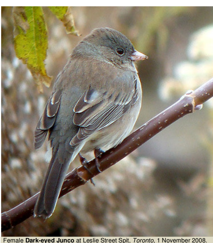
Female Dark-eyed Junco at Leslie Street Spit, Toronto , 1 November 2008.