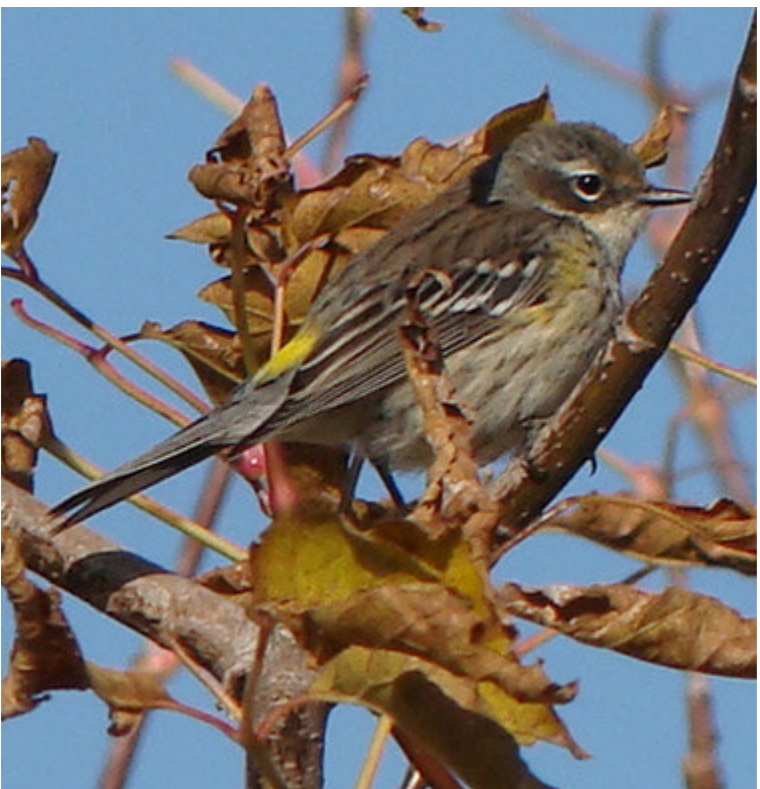
Yellow-rumped Warbler , Leslie Street Spit, Toronto , 1 November 2008.