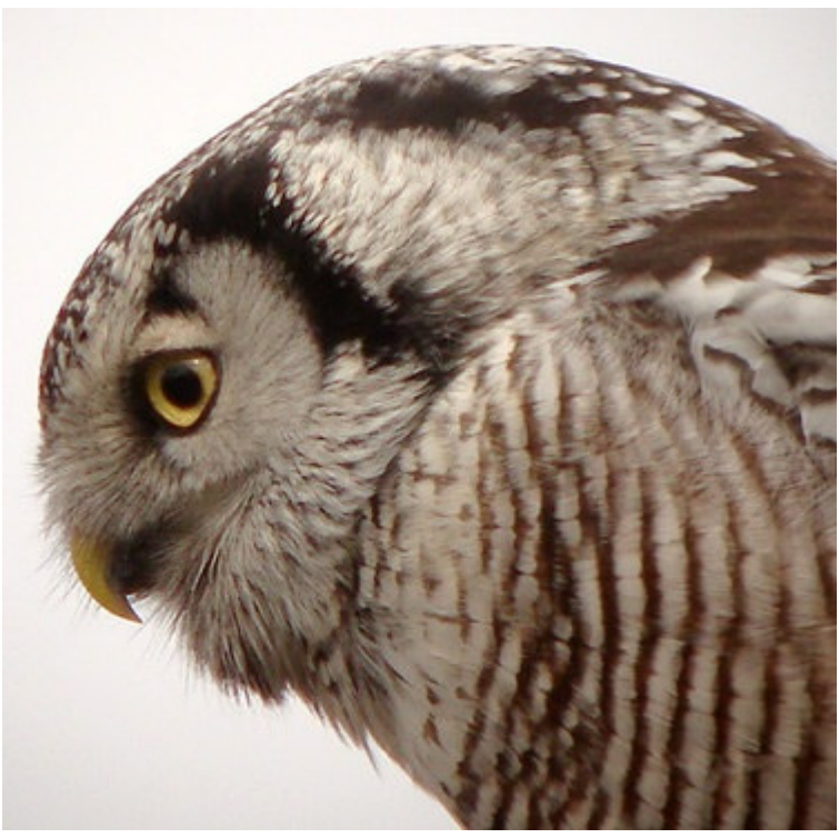
Northern Hawk Owl, Leslie Street Spit, Toronto , 9 Nov 2008.

In the winter of 1962-63, a large irruption of Northern Hawk Owls occurred in southern Ontario. Woodford (1963) stated that "Beginning in mid-October [1962], there has been the largest influx of Hawk Owls into southern Ontario since 1918-1919". According to Goodwin there were