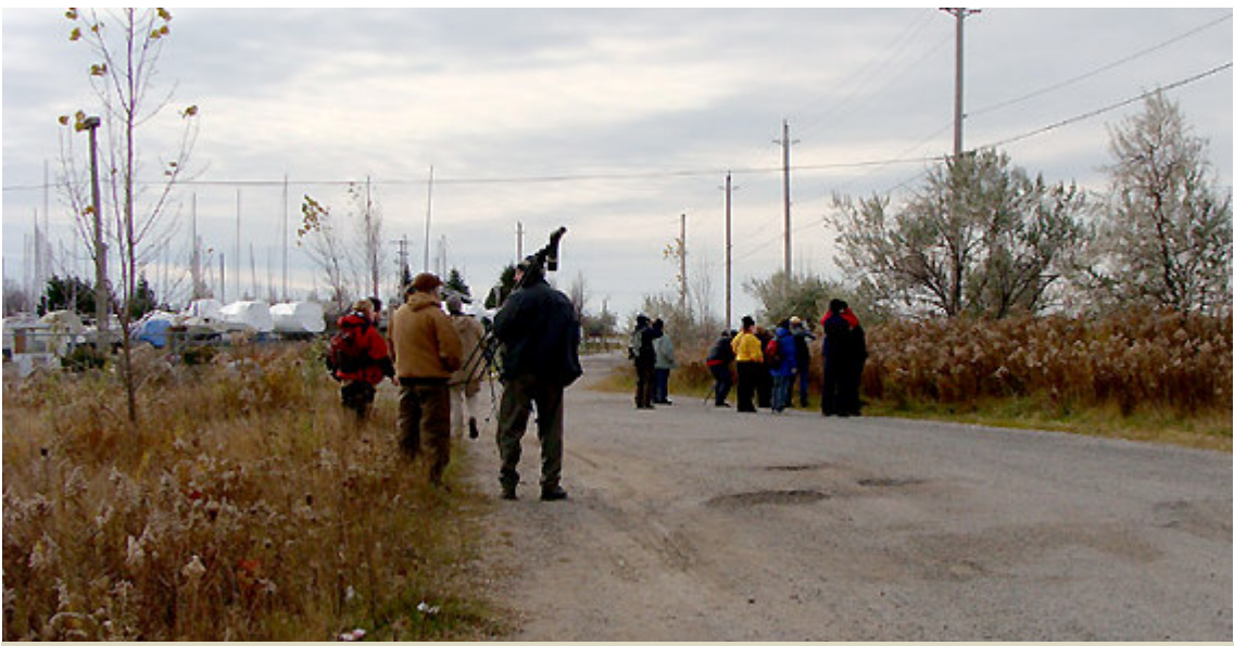
Many birders and photographers enjoyed the Northern Hawk Owl at Leslie Street Spit, Toronto, 9 November 2008.