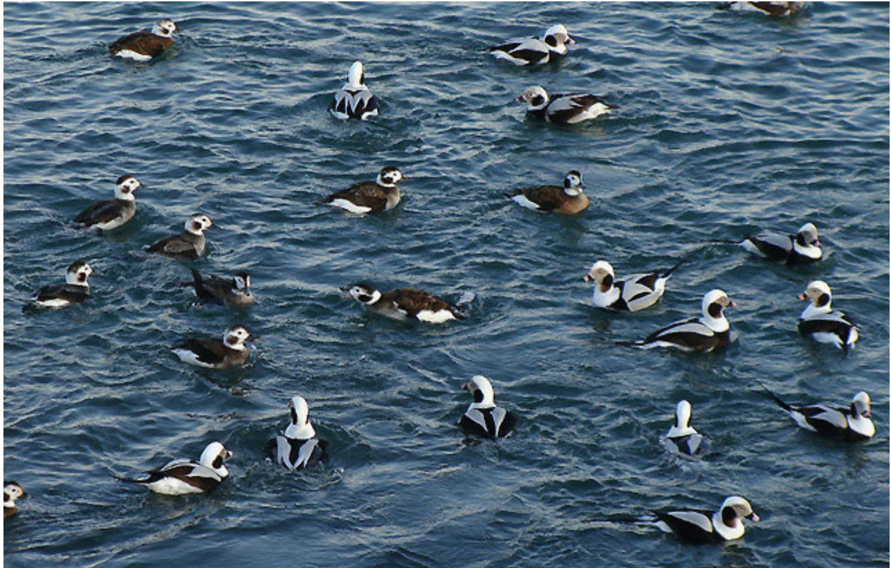
Raft of Long-tailed Ducks at Amos Waite Park, Toronto , 25 December 2008.

RING-NECKED DUCK - 1 at HBP [E] on 6 th (JBMW,DJM).