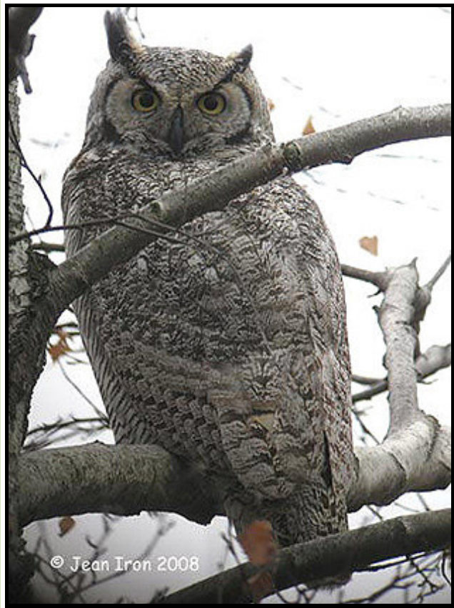
Left : Snyder's Great Horned Owl 1. Same as above showing the vermiculated pattern of the scapulars, coverts, tertials and tail.

the ROM described by Snyder (1961). It is “more coldly grey with bolder bars” than subarcticus from farther west. The latter also is more extensively whitish “with more vague and sparse dark markings below”. Scalariventris further differs from subarcticus by its greyish instead of more whitish facial disks.