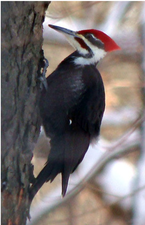
Male Pileated Woodpecker, Sheppard's Bush C.A., Aurora, York, 20 December 2009.