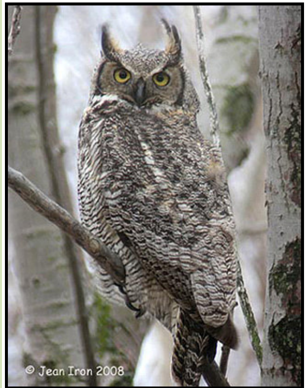
Right: A second Snyder's Great Horned Owl on 14 December showing pattern of the scapulars, coverts, primaries and tail.

The following are useful references pertaining to “Snyder’s” Great Horned Owl: