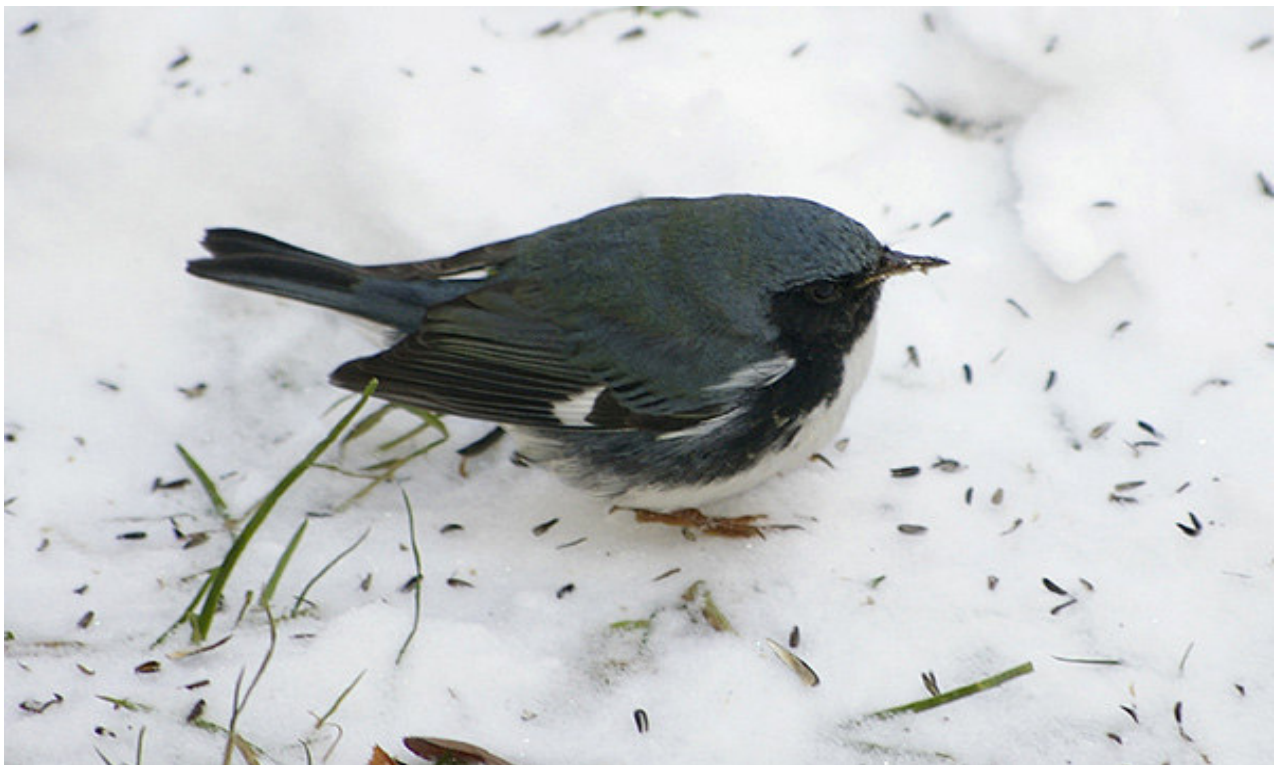
Figure 3. Black-throated Blue Warbler at 44 Belsize Drive, Toronto , 6 December 2008.