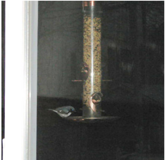
Figure 2. Black-throated Blue Warbler at feeder on Grandview Avenue, Toronto , 12 December 2009, 7:30 a.m.

According to the database, there are just two previous winter records of this species in the GTA. Back in 1989, a female was found at or adjacent to Mount Pleasant Cemetery, Toronto , between 14 January (Harry Kerr) and 19 February 1989 (Don Peuramaki). Other observers on intervening dates included Tim Sabo and Hugh Currie. Several of the sightings may have occurred at a feeder at 167 Welland Avenue, just south of the cemetery, where it was specifically noted on 16 January