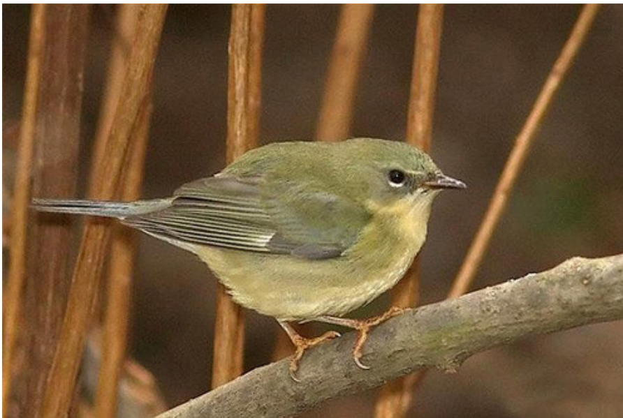
Figure 1. Black-throated Blue Warbler, LaSalle Park, Halton , 12 December 2008.

The first to be reported was a female found at LaSalle Park, Halton on 23 November (anon fide Cheryl Edgecombe fide ONTBIRDS). It was seen again, briefly, on 24 November, but then not reported until 5 December (anon fide Cheryl Edgecombe fide ONTBIRDS). On 11 December it was seen along the boardwalk at 13:00hrs, keeping low and feeding on buckthorn berries (Josh Vandermuellen fide ONTBIRDS). A