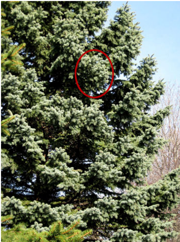
Figure 1. Pine Siskin nest location (circled red) on a Blue Spruce branch at 105 Cedar Brae Blvd., Scarborough, Toronto , 5 April 2009. Nest height was 5.7m, spruce about 10m tall.

Heard and saw several small groups of Pine Siskins zipping around over the length of the street (Fairway Drive, Scarborough). Saw two siskins converging on the same Blue Spruce (one carrying material) on front lawn of 105 Cedar Brae Blvd. near the end of Fairway Drive. Located the dense clump of foliage where they were building a nest (Figure 1). One bird was carrying a fine, whitish material (thought it was a beak full of dry grass), assumed that the nest was still under construction, but nearing completion.