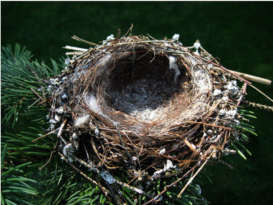
Figure 8. Used Pine Siskin nest on 30 April. Note the bottom of nest was filled with feather scale, and there was a ring of accumulated feces on the rim of the nest.

The nestling period is commonly 15 days, ranging from 13-17 days. Feeding is by regurgitation. The female stays on the nest to brood nestlings during first 7 or 8 days after hatching, then joins male to forage and feed young. Parents continue to feed young about 3 more weeks after fledgling (Dawson 1997).