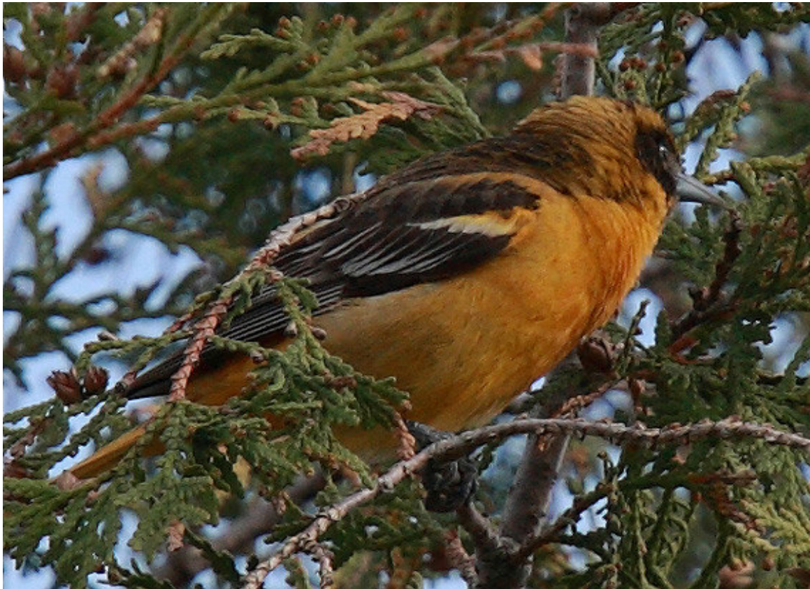
Second year male Baltimore Oriole beginning to acquire its black hood on the head, seen at Hanlan's Point, Toronto Islands, Toronto , 3 May 2009.

BOBOLINK - 1 M at Hanlan's Point, TI on 5 th & 12 at TI on 8 th (NMu,& fide ONTBIRDS). 1 at Hanlan's Point, TI on 9 th , 12 there on 8 th & 8 (7 M, 1 F) there on 13 th (AA). 2 at Baselands, LSS on 10 th (RDC fide ONTBIRDS) & 4 M at HBP [E] on 10 th (MCA,JCa, fide ONTBIRDS).