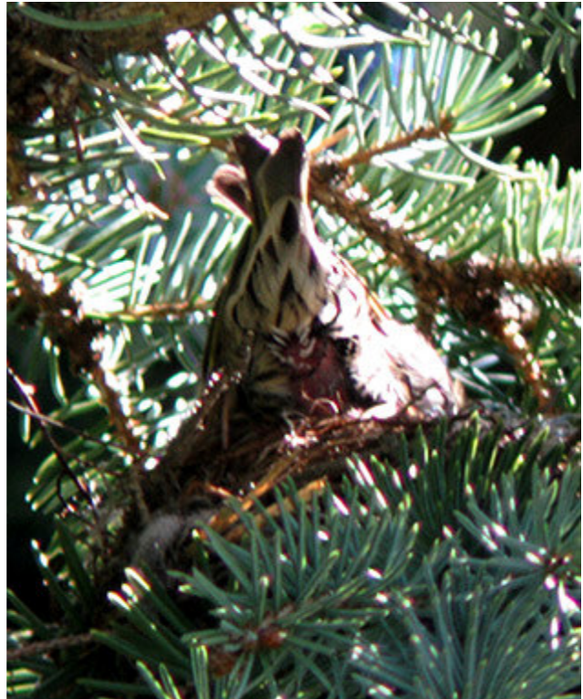
Figure 2. Female Pine Siskin revealing its brood-patch on entering nest, 5 April 2009. Timing of brood patch development evidently varies with individuals, from as early as late February to as late as August, while some birds in spring migration do not develop any at all (Dawson 1997).