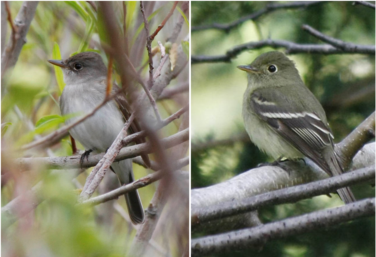
Willow Flycatcher (left) and Yellow-bellied Flycatcher (right) at the Toronto Islands, Toronto, 29 May 2009.