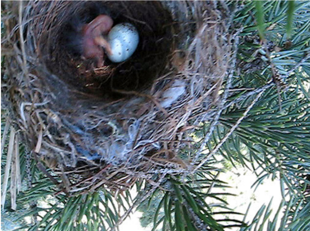
Figure 5. A freshly hatched nestling with an unhatched egg seen on 16 April. Incubation time for this nest was 14 days. Note this photo was taken by mounting a digital camera (on a 'movie' setting) onto an extendable painting pole, and just waved quickly above the nest without disturbing the bird, resulting in a poorer quality of the photo.

Both adults feeding two chicks. First adult would leave and second adult would fly in about ten seconds later. Each feeding took less than 15 seconds. Assume fed by regurgitation as didn't see any food being carried in. Chicks remained well down in nest between feedings. By now a complete ring of feces deposited on outer rim of nest and beyond, subsequent inspection of used nest on 30 April showed no fouling of nest interior,