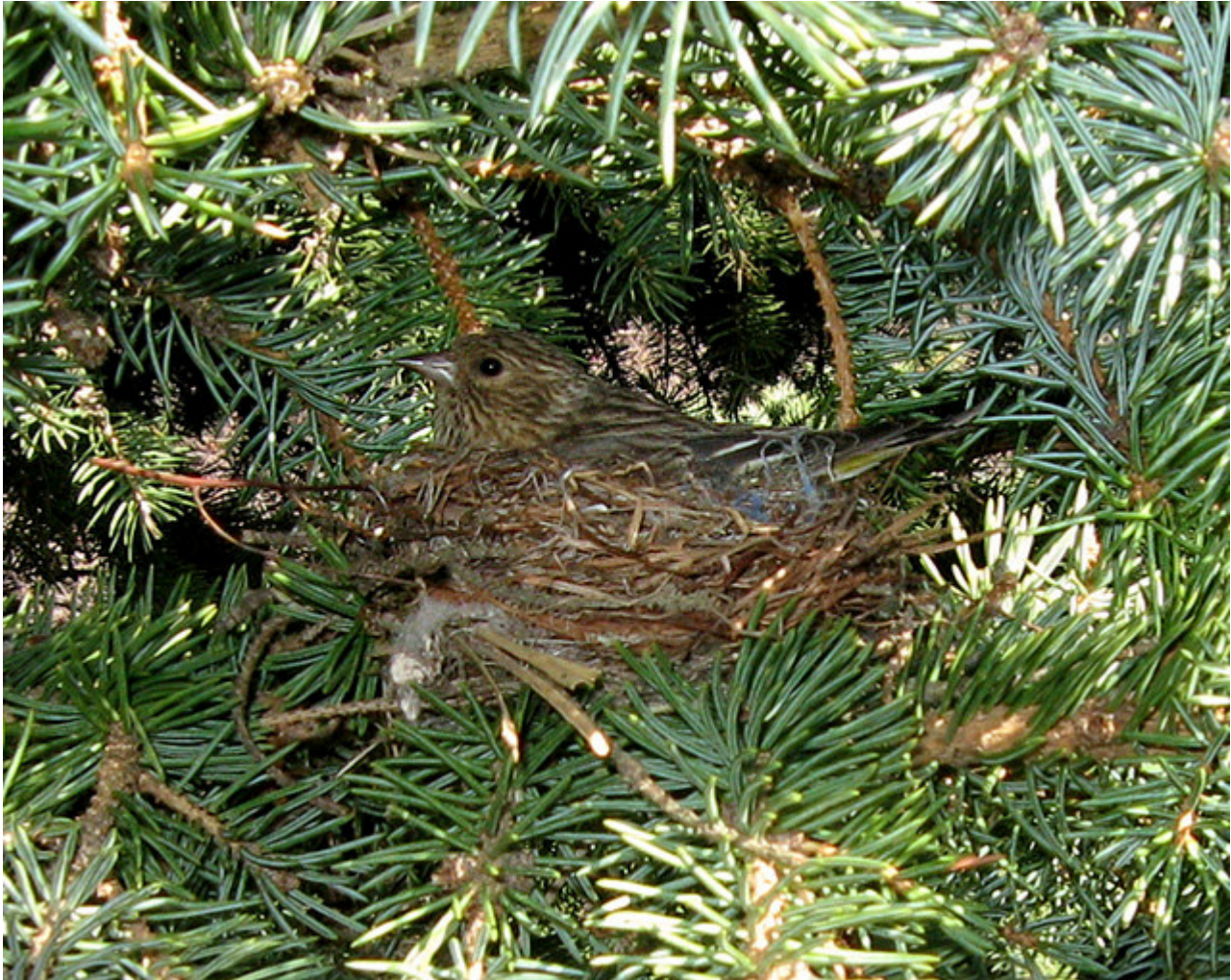
Figure 4. Female Pine Siskin incubating eggs on 9 April 2009. The species' cold hardiness is an important factor that allows early nesting, even at low temperatures with snow cover. Studies have shown that Pine Siskins are capable of sustaining metabolic rates nearly 5 times the basal metabolic rate under cold conditions as severe as -60° to -70°. Extreme tight sitting of the female, plus a well-insulated nest also ensure successful incubation in cold climates. Male feeds female during incubation, which usually lasts about 13 days (Dawson 1997).

16:30 – Sitting, still two eggs, nest seemed bulkier, spent lot of time rearranging nest materials, if not actually adding to it. ( Figure 4 ).