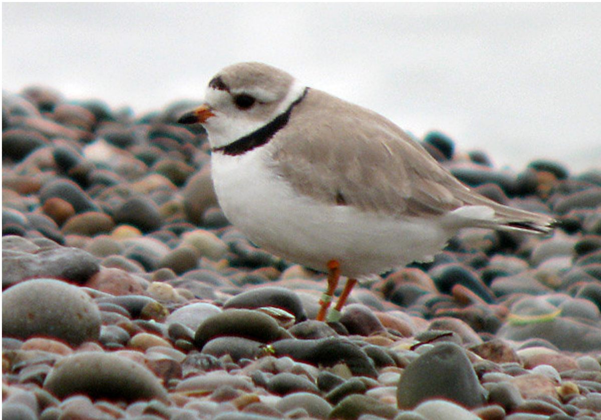
Banded Piping Plover at Darlington Provincial Park, Durham on 27 May 2009. Bands are -Upper left: orange band; Lower left: bicolour lime green/orange; Upper right: USFWS band; Lower right: lime green.

AMERICAN GOLDEN-PLOVER - 1 AD on N side at Britannia Rd E of 4th Line, Halton on 22 nd (DEP fide ONTBIRDS).