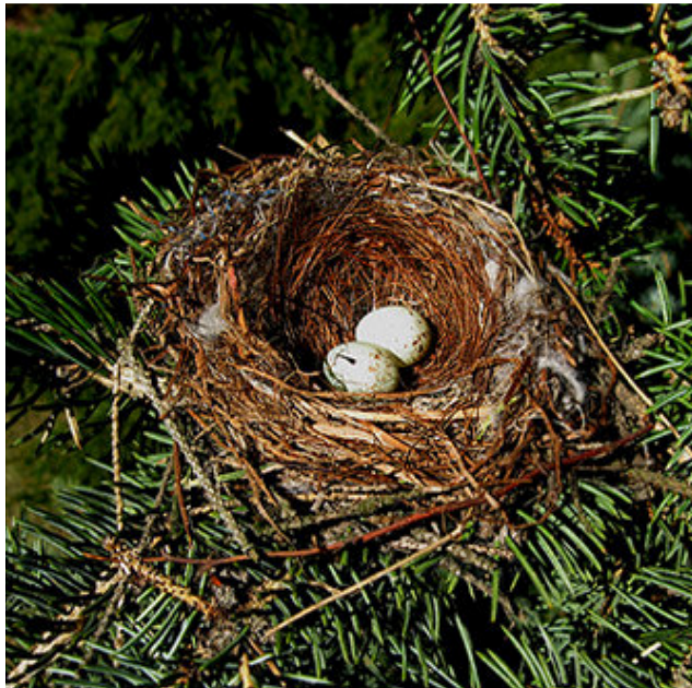
Figure 3. Pine Siskin nest with 2 eggs at 12:38hrs on 5 April 2009. Note there was quite a lot of gray fibre in the nest, probably a material chosen for insulation and support.

Pine Siskins may lay eggs several days after nest completion. Clutch 1 – 6 eggs, most commonly 3 or 4. Incubation probably begins with first egg. Usually single-brooded, possibly have first brood as soon as suitable habitat found in spring, then move north to the regular breeding range for a second brood, but not confirmed (Dawson 1997).