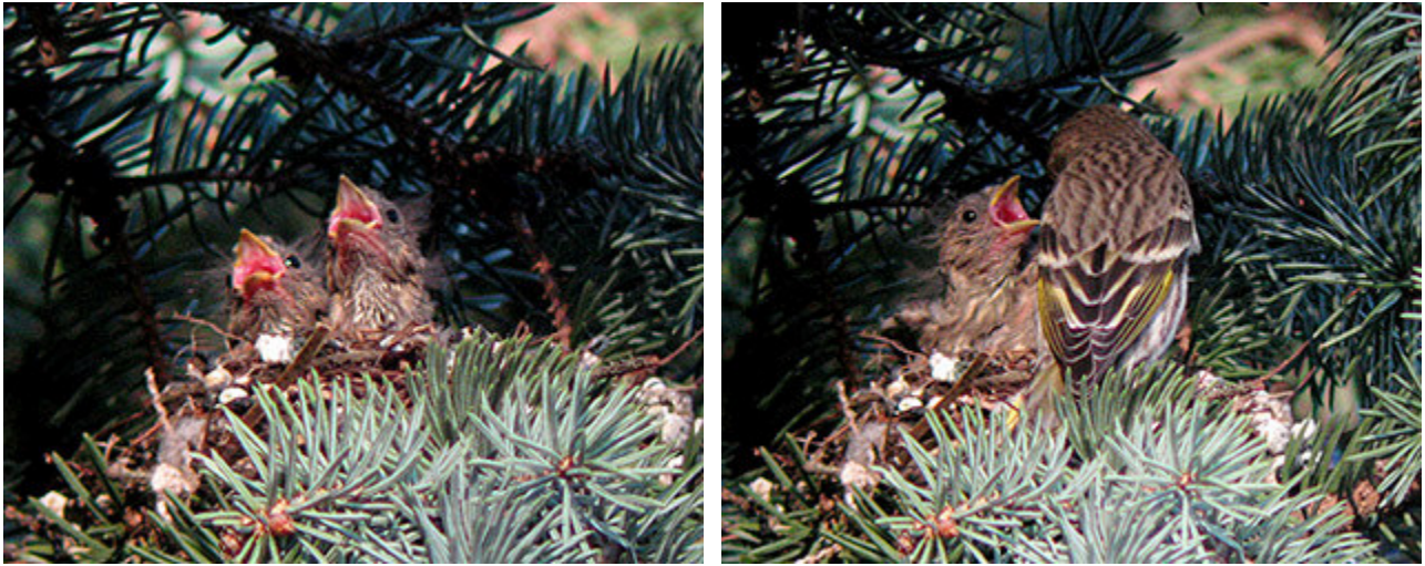
Figure 6 (Left) Two nestlings aged 13 days seen on 28 April and Figure 7 (Right) Adult feeding nestling on 28 April. This nest fledged on the 15 th day.

The nestling period is commonly 15 days, ranging from 13-17 days. Feeding is by regurgitation. The female stays on the nest to brood nestlings during first 7 or 8 days after hatching, then joins male to forage and feed young. Parents continue to feed young about 3 more weeks after fledgling (Dawson 1997).