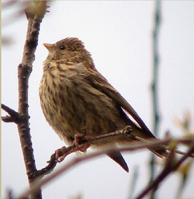
Pine Siskin fledgling begging at the Meadow, Thickson's Woods, Durham, on 3 May 2009.