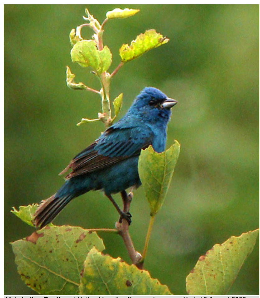
Male Indigo Bunting at Holland Landing Sewage Lagoons, York , 16 August 2009.

AMERICAN GOLDFINCH - 5 reports from 19<sup>th</sup> to 31<sup>st</sup> from TI with a high count of 62 on 25<sup>th</sup>(Mu,MVL,ICa).