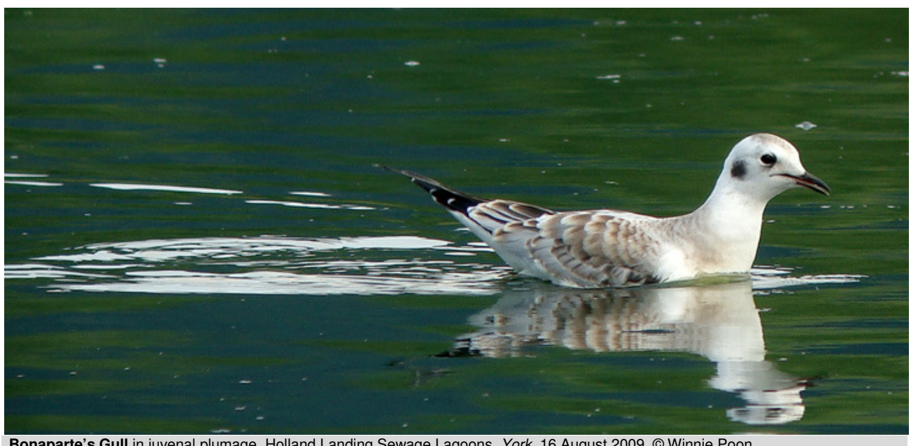
Bonaparte's Gull in juvenal plumage, Holland Landing Sewage Lagoons, York, 16 August 2009.

Names in ITALICS indicate subspecies, hybrids, morphs or other 'recognizable forms', which may be identifiable in the field. This does not necessarily imply that the compilers agree with such designations, or accept their validity.