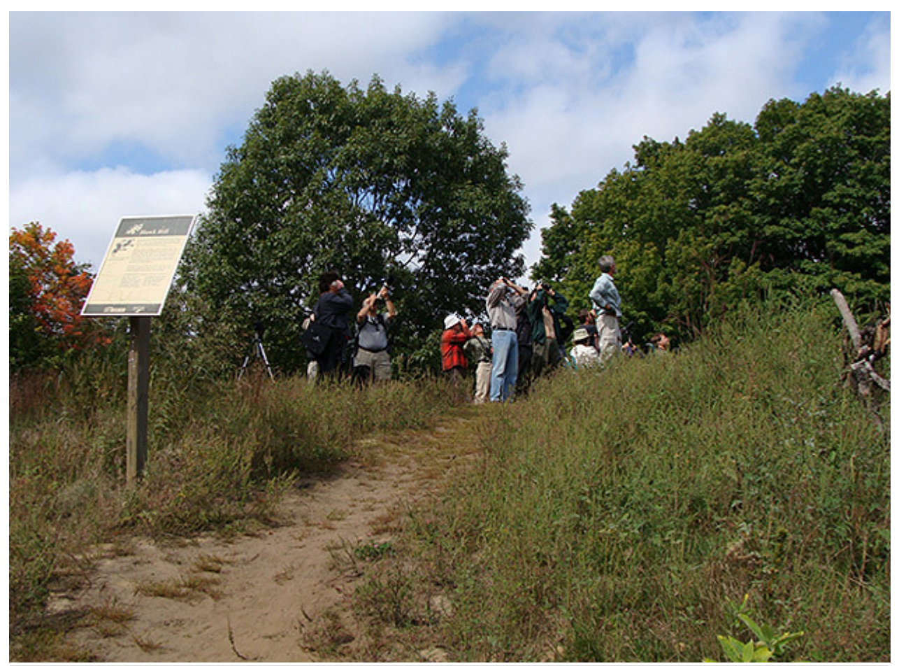
High Park Hawk Watch on Hawk Hill, High Park, Toronto, 22 September 2008.

The High Park Hawk Watch website will continue to be the primary source of information regarding historical records of raptor observations in High Park, Toronto.