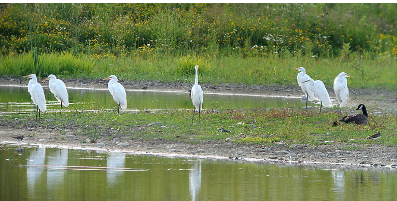
Seven of the 13 Great Egrets day-roosting at Reesor Pond, Markham, York, 19 July 2009 – a new record high count for the GTA.