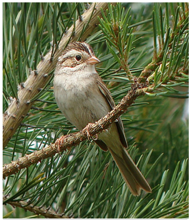
Nesting Clay-colored Sparrow at Uxbridge Countryside Preserve, Durham, 12 July 2009.