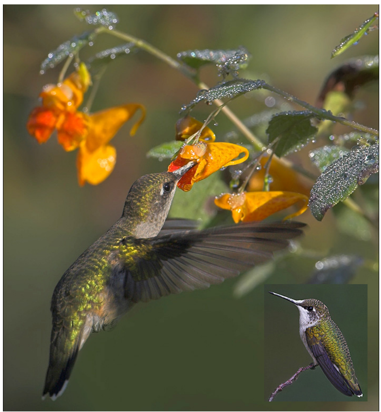
Migrating Ruby-throated Hummingbirds at the Cranberry Marsh - South Platform, Durham , 7 September 2008. Plenty of Jewelweed Impatiens capensis flowers around the platform evidently providing a big attraction for the hummers.