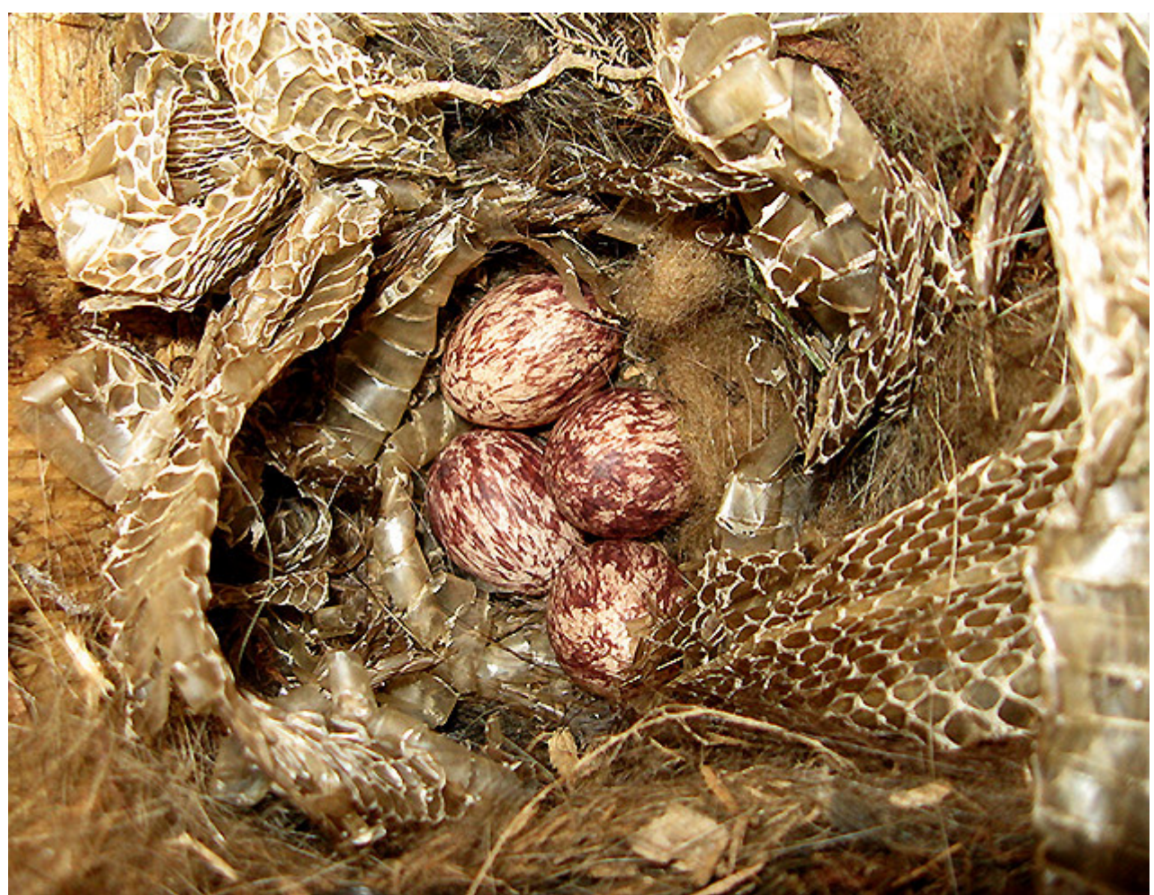
Great Crested Flycatcher nest at 7 Fairway Drive, Scarborough, Toronto , 14 June 2009. The five nestlings failed to fledge. Feedings to the nestlings had ceased after about 10 days, maybe due to a notable lack of bugs in early summer?

GREAT CRESTED FLYCATCHER - 1 nest at 7 Fairway Dr., Scarb. on 14<sup>th</sup> (RLau). Nest with 4 eggs in nestbox in backyard, decorated with snakeskins. Photo on file.