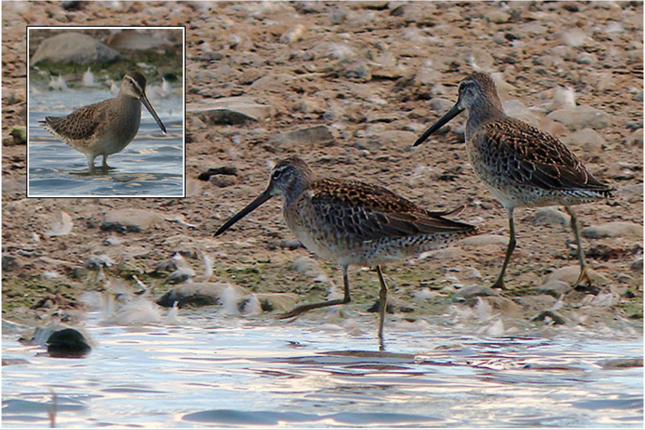
Juvenile Long-billed Dowitchers at Sobey's Pond, Durham , 13 September 2009. Note the bib-like gray neck and breast of the bird (inset), plain tertials, fresh neat upperparts, and broader black tail bars seen on one of the birds.

WILSON'S SNIPE - 12+ at Britannia Rd E of 4th Line, Halton on 5<sup>th</sup> (DEP fide ONTBIRDS), 5 at Ravenshoe Road Floodlands, York on 13<sup>th</sup> (BB) (Brydon 2009) & 3 at Cranberry Marsh, Durham on 29<sup>th</sup> (CMRW fide JDL, fide ONTBIRDS).