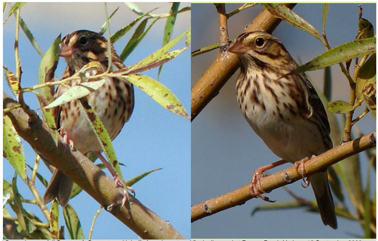
Several young fall Savannah Sparrows with buffy face, breast and flanks lingered at Reesor Pond, York , on 13 September 2009. After mid-September it would be difficult to separate the young from the adults.

SAVANNAH SPARROW - 34 at Hanlan's Point, TI on 24th & 19 on 25th (NMu,MVL,ICa).