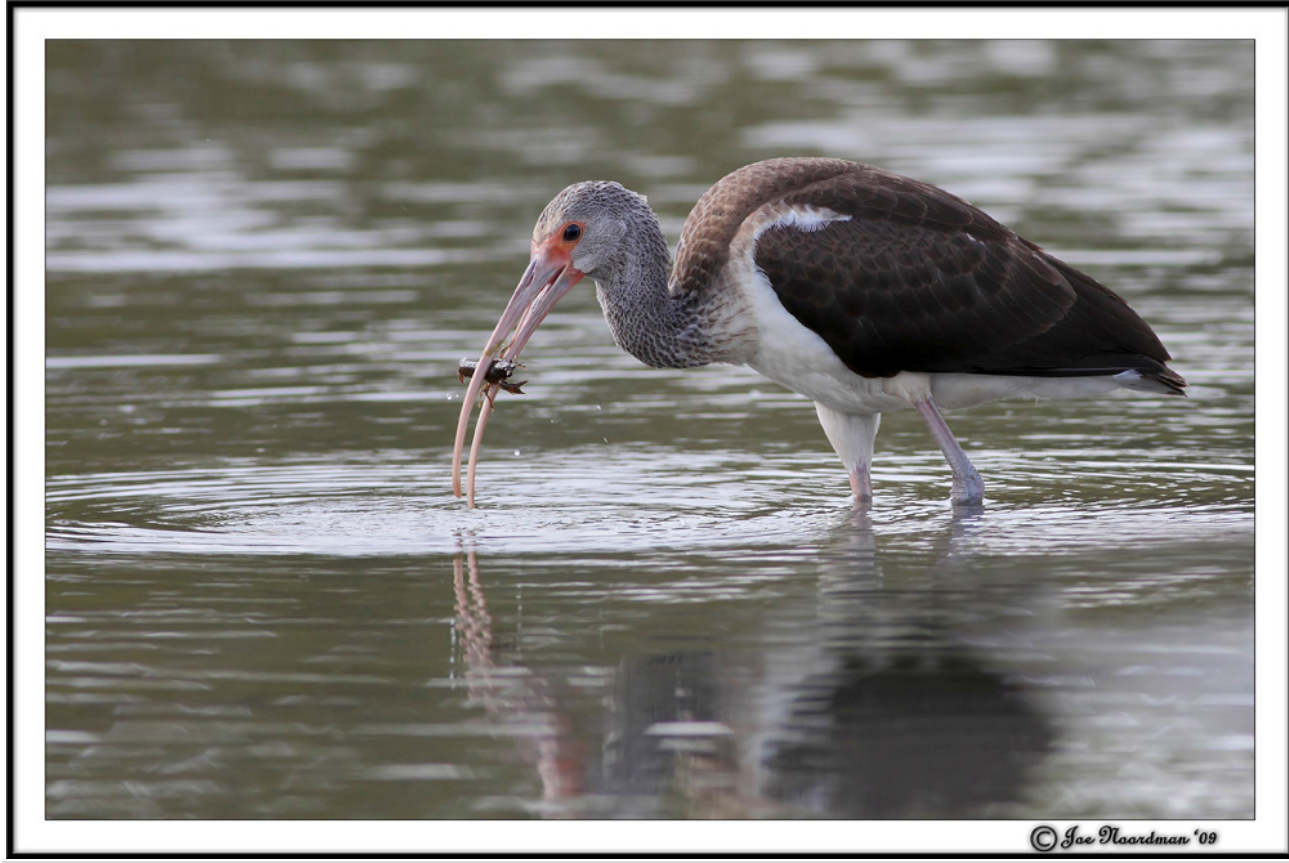
Figure 1. White Ibis with a crayfish in its bill, Whitby Harbour, Durham, 3 October 2009.

Joe and Harvey watched the White Ibis there for more or less ten minutes. The ibis was feeding on crayfish (Figure 1), which may constitute 60% of the diet in the southern U.S. (Palmer 1962). It even picked up a fishing lure, luckily, it was quickly rejected without causing any injury (Figure 2).