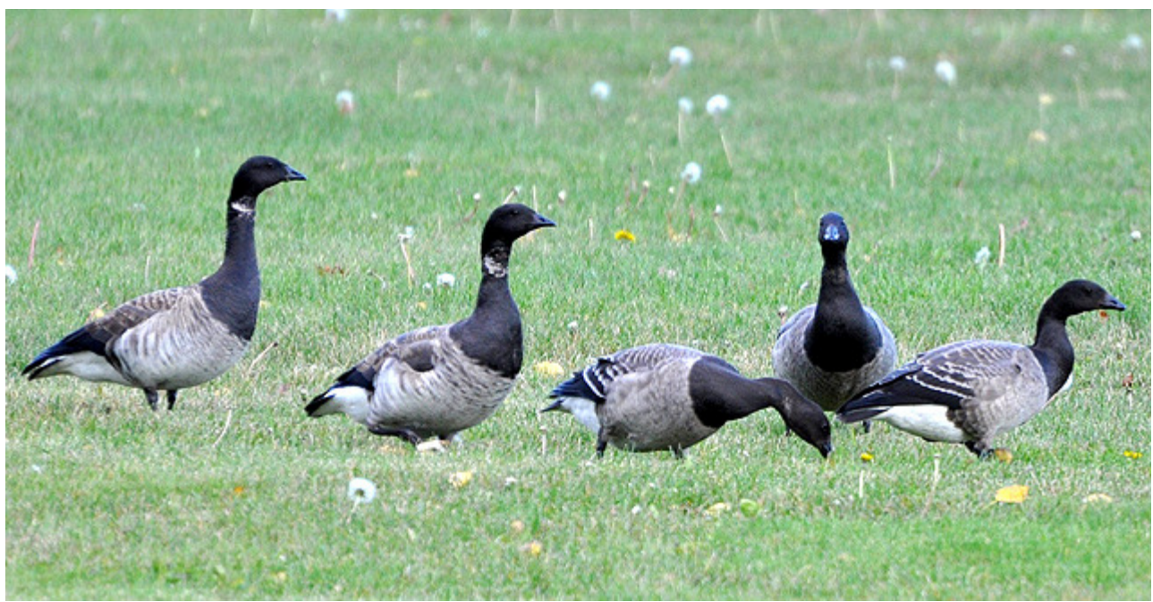
Five of the Brant (2 adults, 3 juveniles) that frequented Ajax Waterfront Park, Durham, 31 October 2009.

BRANT - 6 (3 AD, 3 imm) at Ajax Waterfront Park, Durham on 30<sup>th</sup> (Lisa Klue fide Gcarp; GCarp fide ONTBIRDS). The 6 were seen again there at16:15hrs on 31<sup>st</sup> (Lev Frid fide ONTBIRDS) having not been present at 13:05hrs.