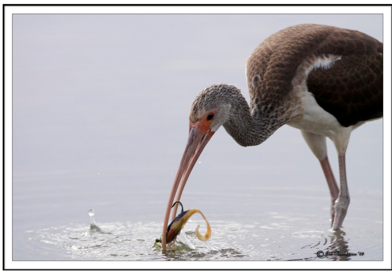
Figure 2. The White Ibis dredged an artificial lure with a big hook from the mud, sensibly, he spit out the lure and went back to fishing his normal food. Whitby Harbour, Durham , 3 October 2009.

At about 15:30 the White Ibis left and flew to the south (Figure 3). It did not return, nor was it found again the next morning by Joe.