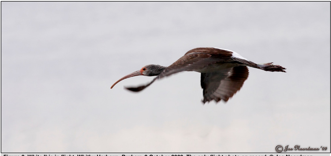
Figure 3. White Ibis in flight, Whitby Harbour, Durham, 3 October 2009. The only flight photo on record.

At about 15:30 the White Ibis left and flew to the south (Figure 3). It did not return, nor was it found again the next morning by Joe.