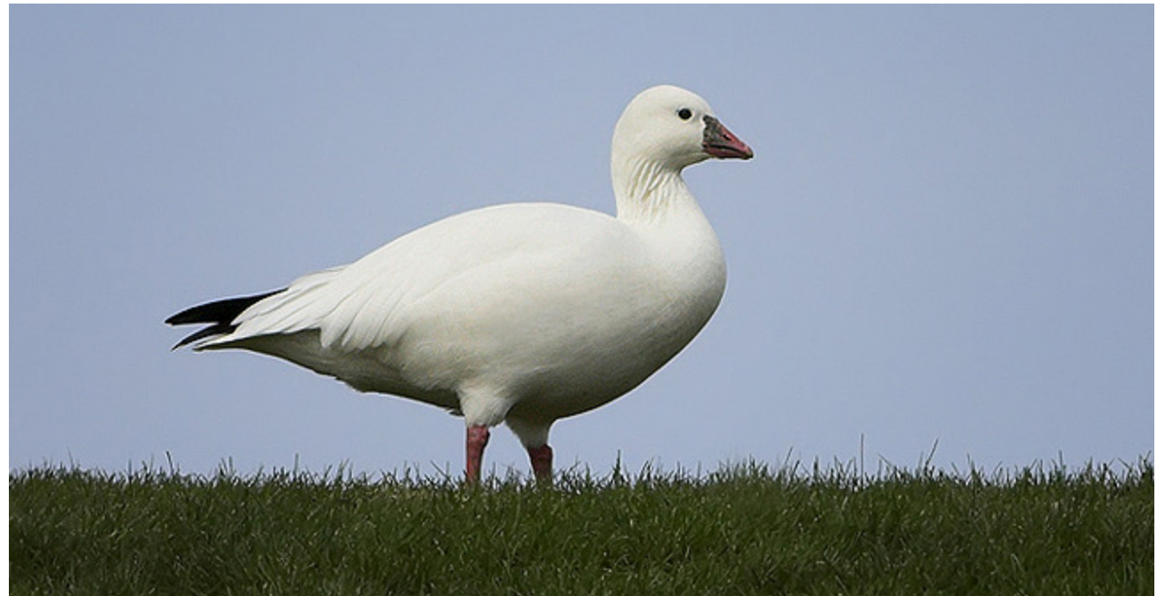
Adult Ross's Goose at Bayly Street and Shoal Point Road, Ajax, Durham, 15 October 2009.

ROSS'S GOOSE - 1 at Reesor Pond, York @ 12:00hrs on 8<sup>th</sup> [No doc. seen] (SLo fide ONTBIRDS). 1 AD at Bayly St & Shoal Pt Rd, Ajax, Durham on 15<sup>th</sup> (JES fide RPye), seen in am while driving to Cranberry Marsh hawkwatch; still there on return in pm so stopped to photograph it. Only later (2 Nov 2009) realized it might be a Ross's Goose. 1 JUV at Lynde Shores C. A. (S end of Lynde Creek Marsh), Durham on 17<sup>th</sup> [No doc. seen] (AA fide ONTBIRDS).