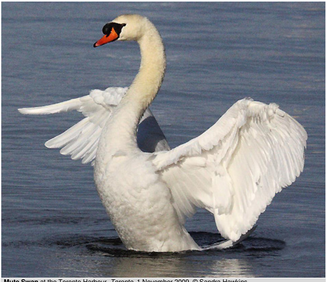
Mute Swan at the Toronto Harbour, Toronto, 1 November 2009

Names in ITALICS indicate subspecies, hybrids, morphs or other 'recognizable forms', which may be identifiable in the field. This does not necessarily imply that the compilers agree with such designations, or accept their validity.