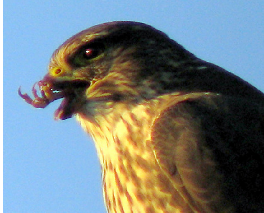
The Merlin at 183 Midwest Drive, Scarborough, Toronto, 10 November 2009. Apparently, dinner was good to the last feet!