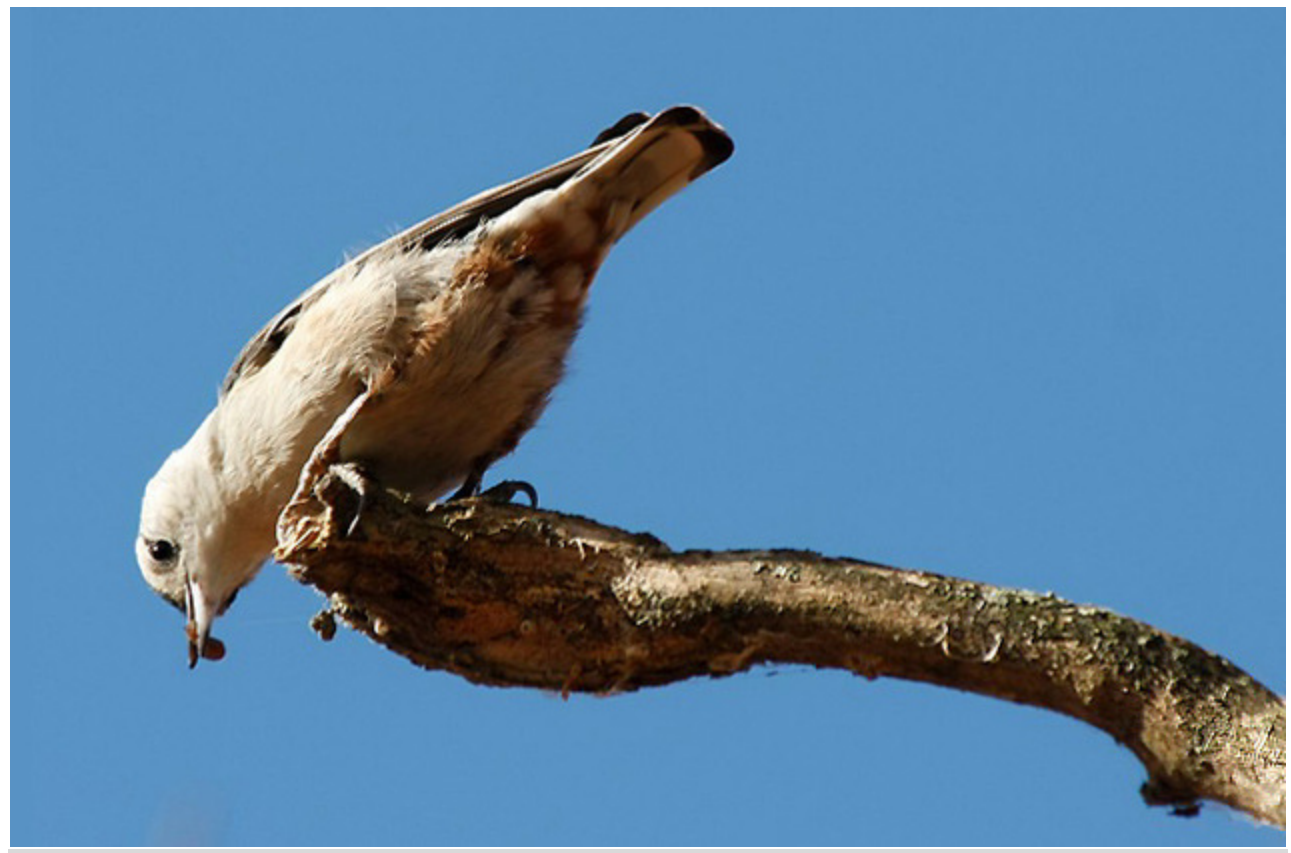
A foraging White-breasted Nuthatch at the Toronto Islands, Toronto, 14 November 2009.

Preferred citation: Worthington, D. 2009. Greater Toronto Area Bird Report: November 2009. Toronto Birds 3(10):213-221.