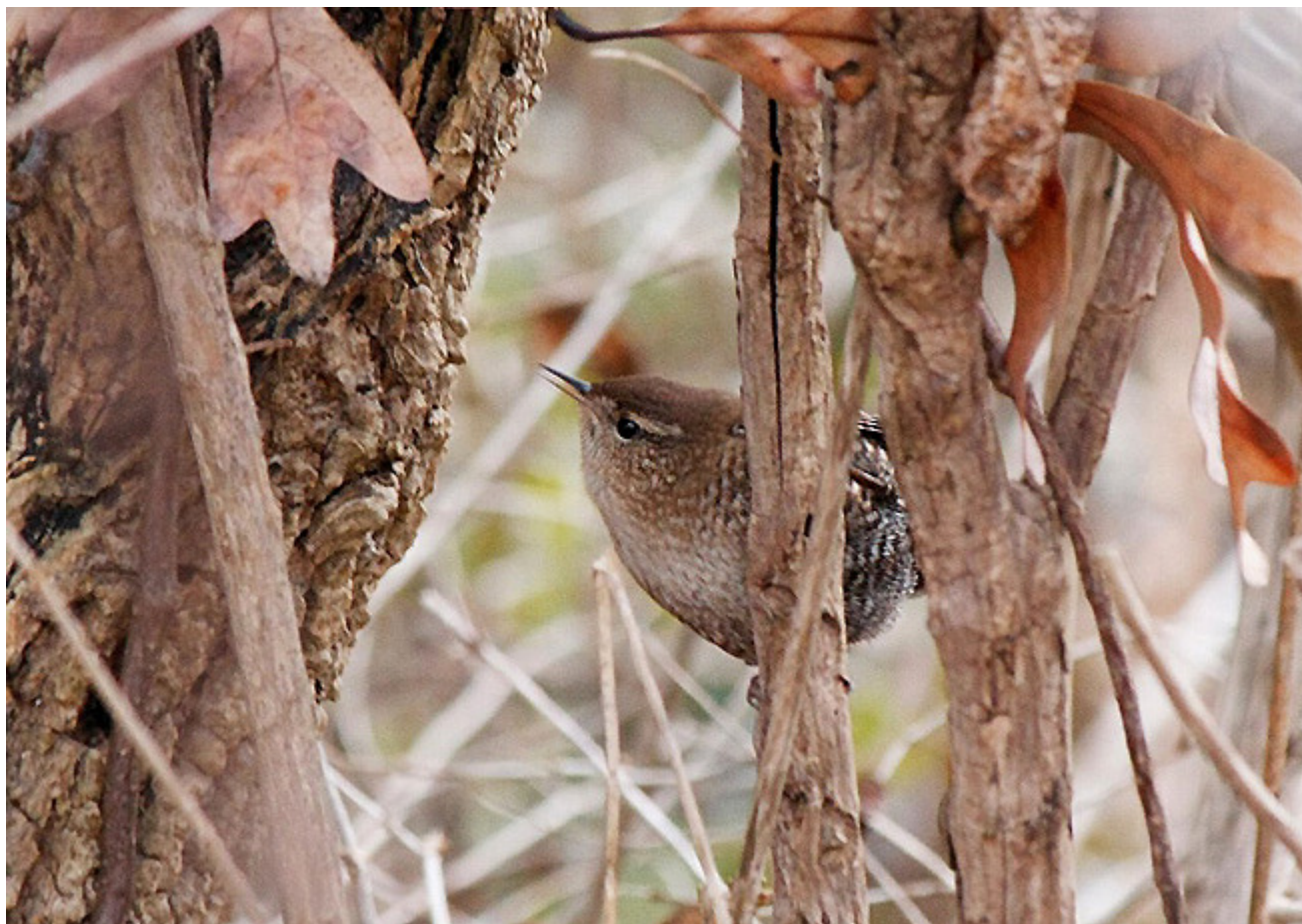
Winter Wren at High Park, Toronto, 20 December 2009.

recent years. On the other hand the Toronto CBC set a new record (40), compared to a previous high of 34 in 2006. Counting all reports with details provided (including those from CBCs), there were 32 from Toronto , 15 from York , 4 from Peel and none from Durham or Halton . Thanks to all regular contributors for their ongoing reports, and please continue to submit them.