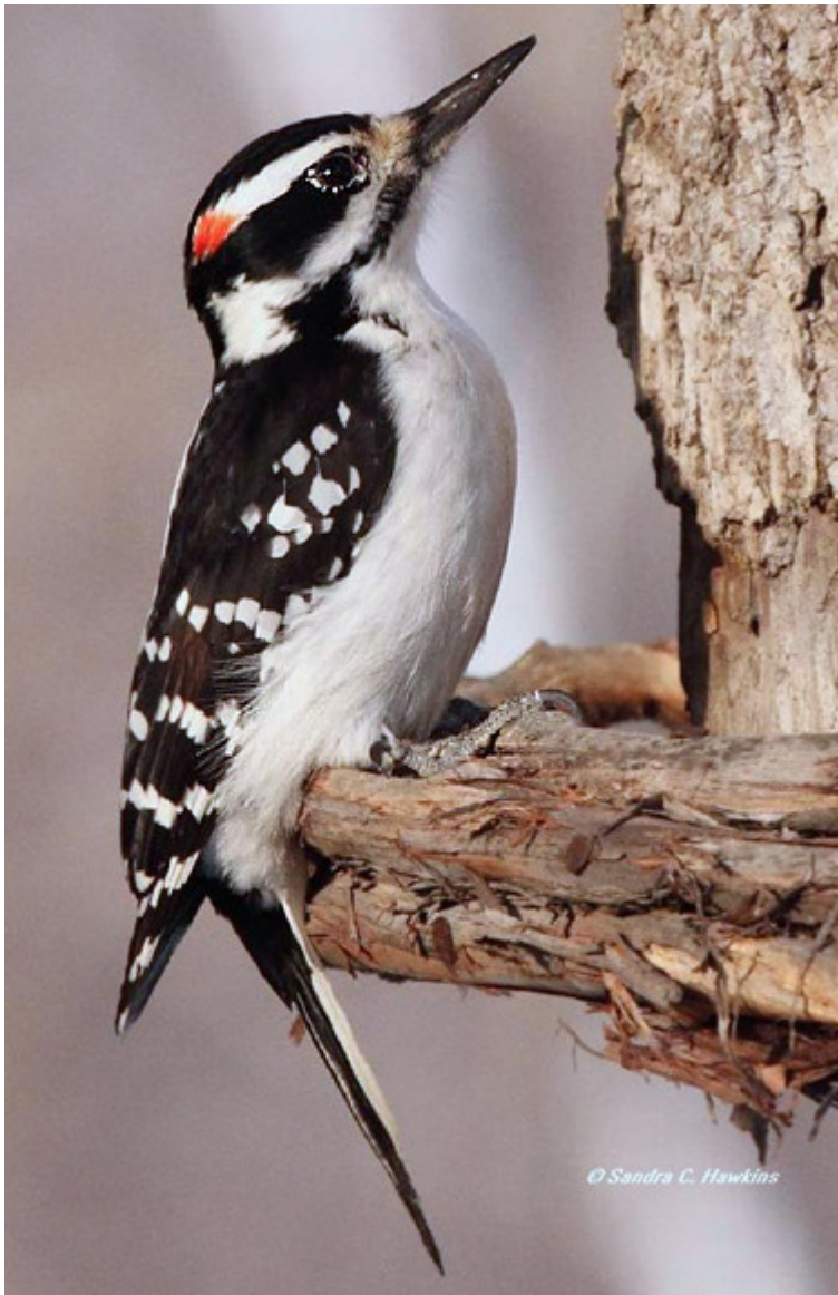
Male Hairy Woodpecker at Metro Zoo, Toronto , 28 December 2009.

HAIRY WOODPECKER - 7 at LSS on 5 th (NMu,ICa,EO'C), on Peninsulas B and D – an unusual # for LSS?