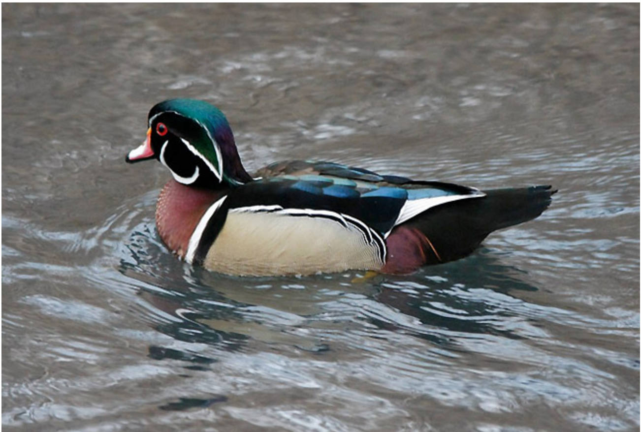
Wood Ducks are uncommon in the GTA in winter; this crisp male was seen at High Park, Toronto , 20 December 2009.

Names in ITALICS indicate subspecies, hybrids, morphs or other 'recognizable forms', which may be identifiable in the field. This does not necessarily imply that the compilers agree with such designations, or accept their validity.