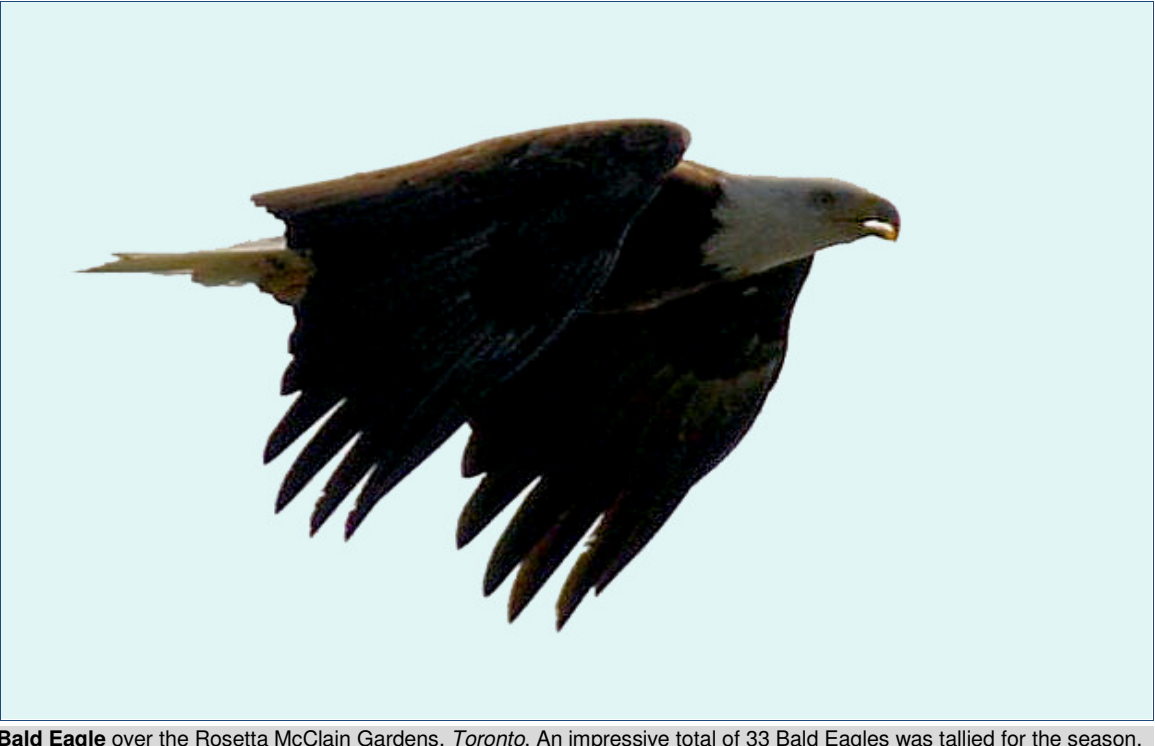
Bald Eagle over the Rosetta McClain Gardens, Toronto . An impressive total of 33 Bald Eagles was tallied for the season. Photo taken on 13 October 2009.