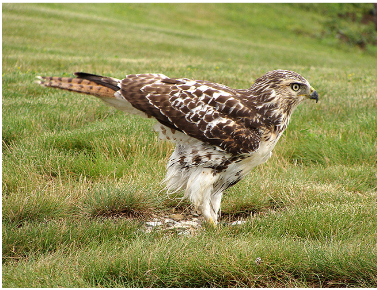
A wet Red-tailed Hawk drying off on the ground after a thunderstorm, Peel, 26 July 2009.