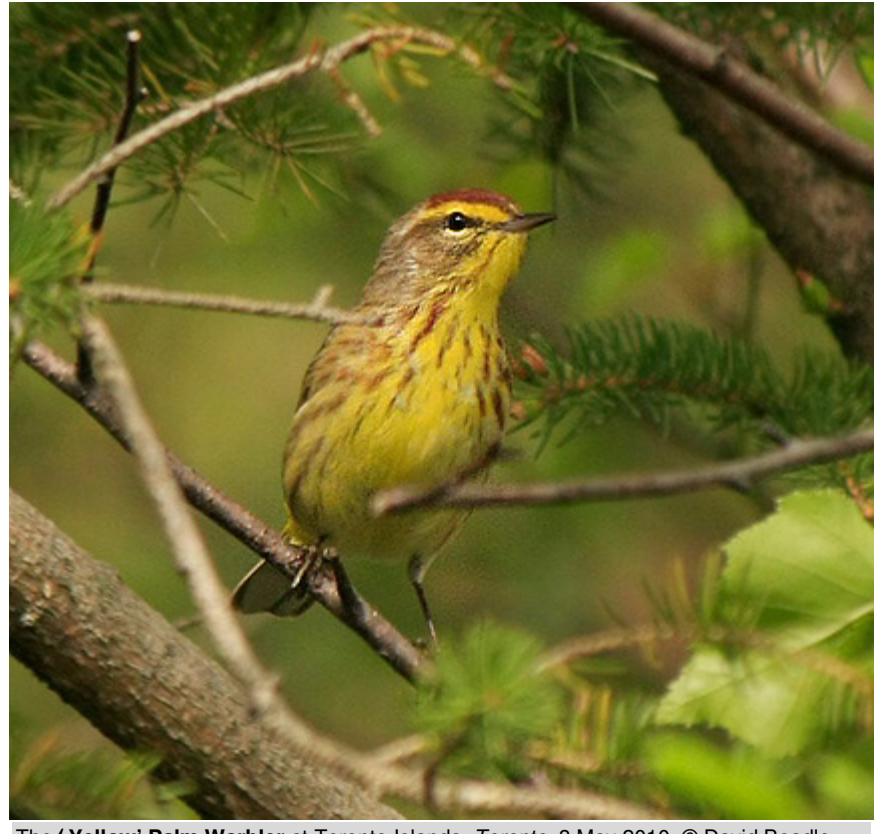
The 'Yellow' Palm Warbler at Toronto Islands, Toronto, 8 May 2010.