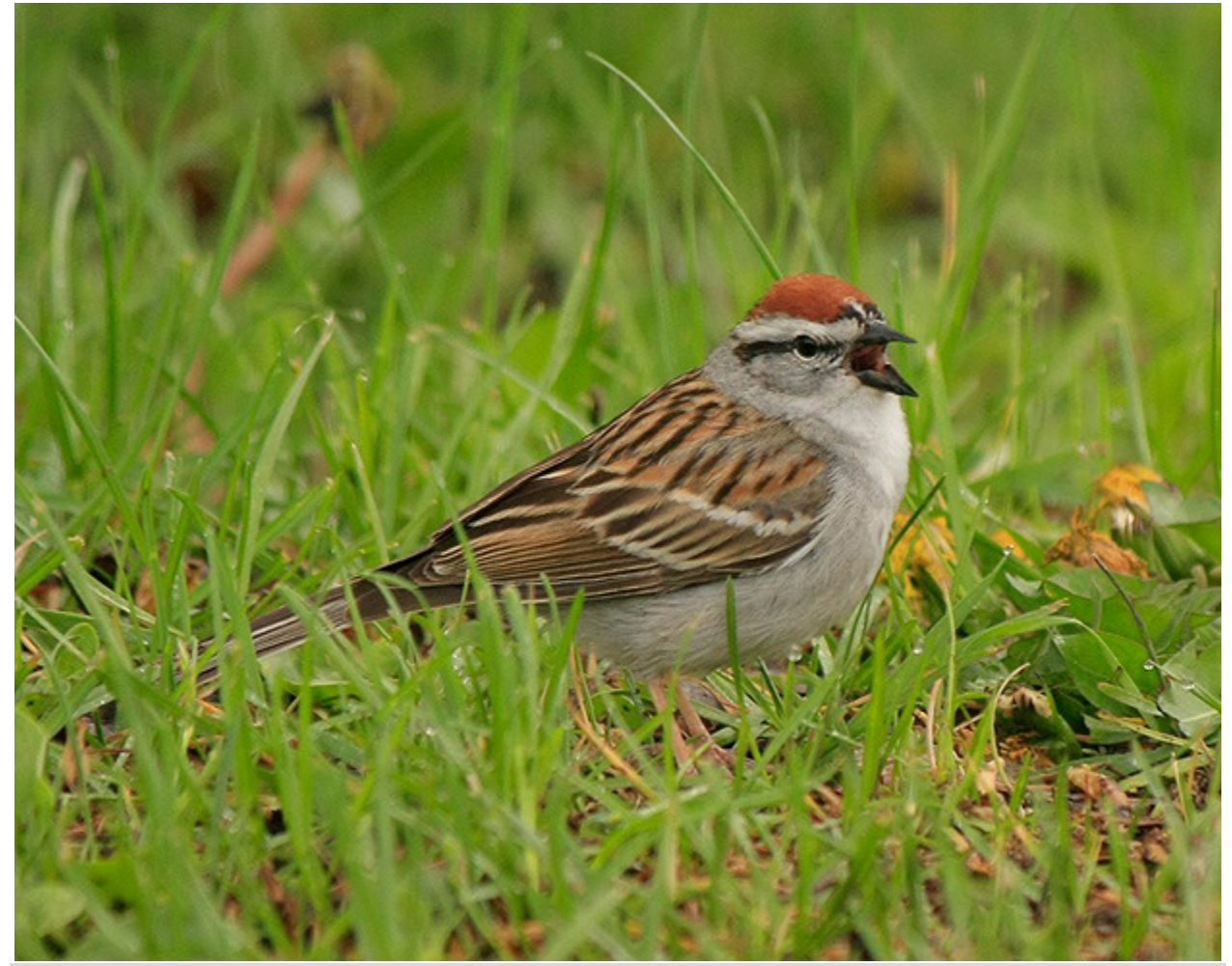
Chipping Sparrow at Toronto Islands, Toronto, 8 May 2010.

CHIPPING SPARROW - 16 at TI on 1st (NMu, MVL) & 12 at Ward's Island, TI on 5th (AA).