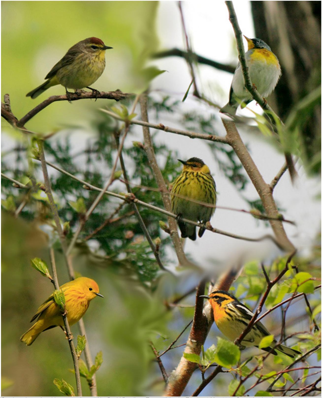
Good numbers of warblers were observed by David Beadle at Toronto Islands, Toronto , 8 May 2010. Some that he photographed were [Top left to right] - 'Western' Palm Warbler, Northern Parula, Cape May Warbler, Yellow Warbler, and Blackburnian Warbler.