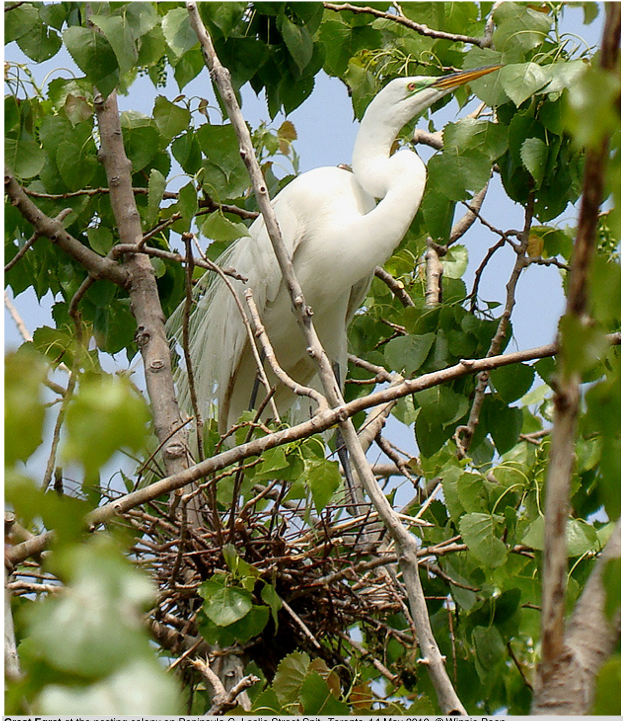
Great Egret at the nesting colony on Peninsula C, Leslie Street Spit, Toronto, 14 May 2010.

LITTLE BLUE HERON - 1 (breeding plum.) AD at South Platform, Cranberry Marsh, Durham on 9th was first seen @ 08:00hrs (RPye fide MJCB, fide ONTBIRDS). It spent most of the day in the cattails, hiding from the cold wind but was seen again that day @ 10:25hrs (AK fide ONTBIRDS), @13:25hrs (MJCB fide ONTBIRDS) & @ 17:10hrs (DVW fide ONTBIRDS). It was last reported there @ 11:30hrs on 10th (HC fide ONTBIRDS) after a wait of 2 hrs before it showed itself. [No doc. seen for any of these reports].