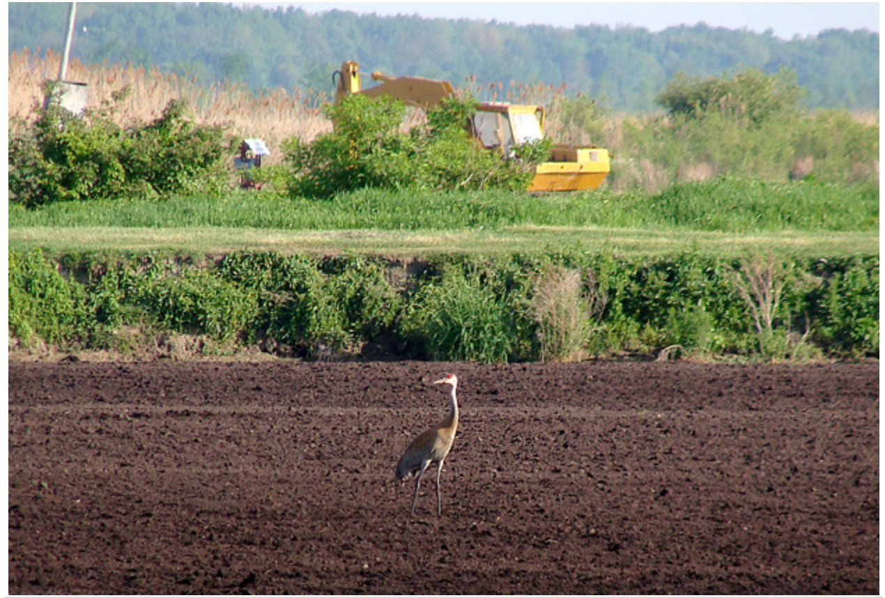
One of the nesting Sandhill Cranes observed foraging on agricultural land at Ravenshoe Flats, Holland Marsh, York , 29 May 2010.

SANDHILL CRANE - 1 over Walkers Line & Hwy 407, Halton on 4th (anon fide CEE, fide ONTBIRDS) &1 over Thicksons Woods, Durham on 22nd (MJCB,BH). 3 (2 AD, 1 FY) at Ravenshoe Flats, York on 23rd (BB,SM) were seen on a dyke at S end of Yonge St. [Documented]. FIRST CONFIRMED breeding for York R.M. (and hence GTA). 2 there on 24th (Irving Himel fide FP) when several good photos were obtained of one of the adults, at the W end of the dyke running E-W to Holland River. Also on 24th, photo-documentation of the adults and chick was obtained (KRS). 3 (2 AD, 1 FY) seen there (same dyke, near the Holland River) @ 08:20hrs on 29th (RBHS,WP,Marshall Folk); the small downy young reached about 'knee' height of AD. It was basically orange-brown, downy; clearly not flying yet. Birds moved N and hid in vegetation.