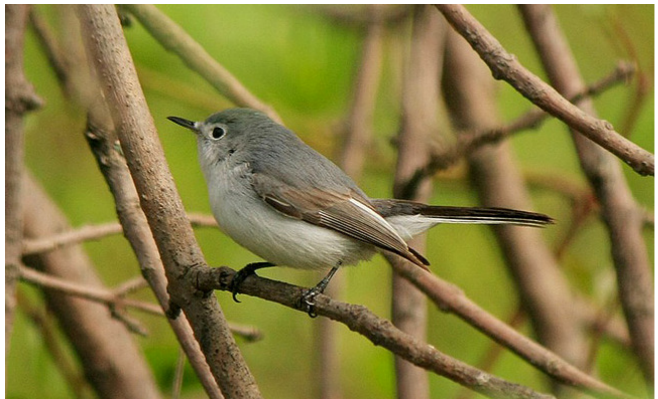
Blue-gray Gnatcatcher seen at Toronto Islands, Toronto, 8 May 2010. Note the brown greater coverts and primaries.