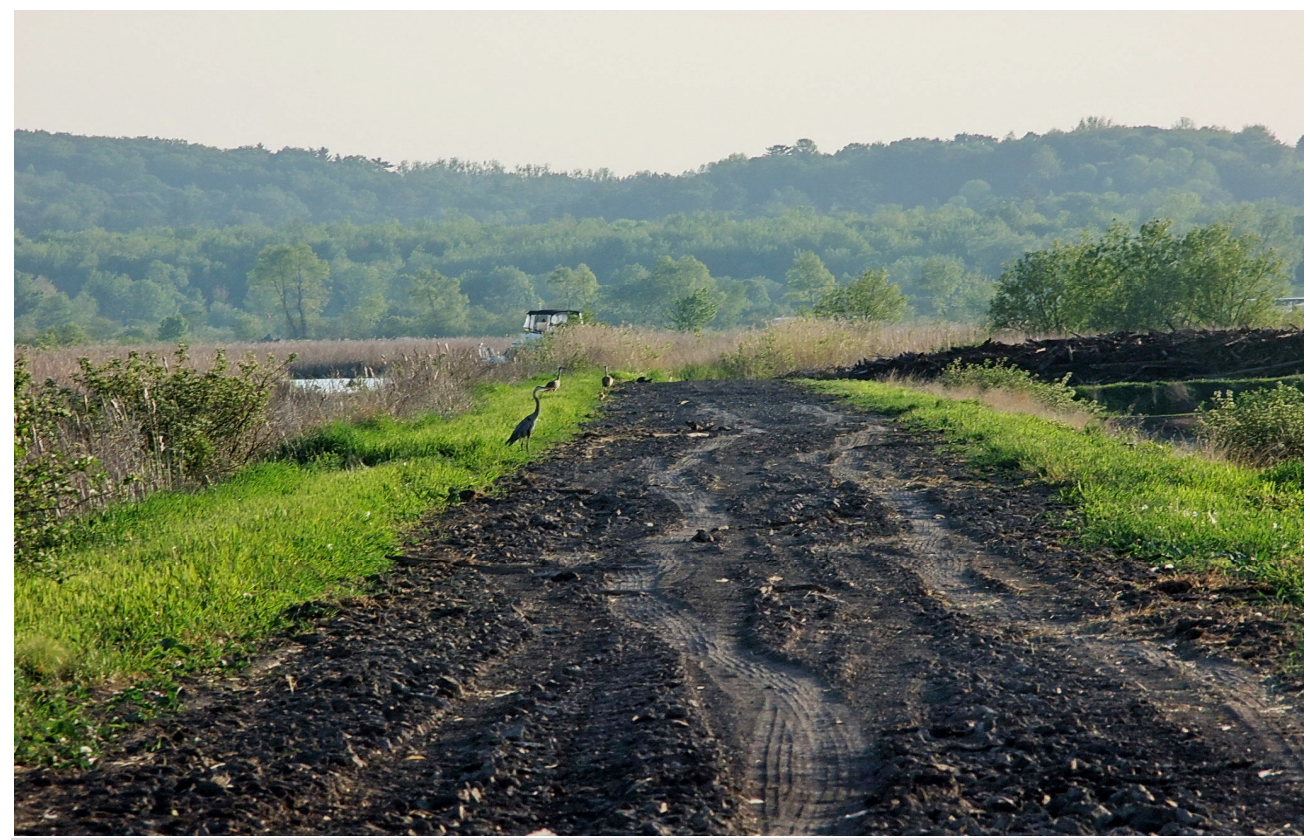
Figure 3. Sandhill Crane pair with one small young at Ravenshoe Flats, York R.M. on 24 May 2010. Note the Great Blue Heron in the 'foreground', Holland River on left, and driving conditions on the dike.