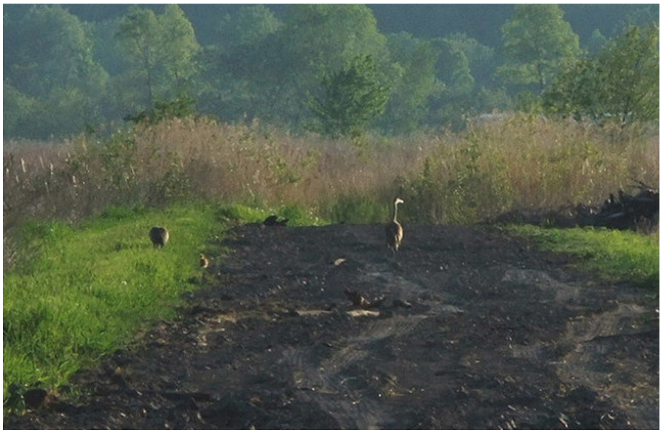
Figure 2. Sandhill Crane pair with one small young, Ravenshoe Flats, York R.M. on 24 May 2010.