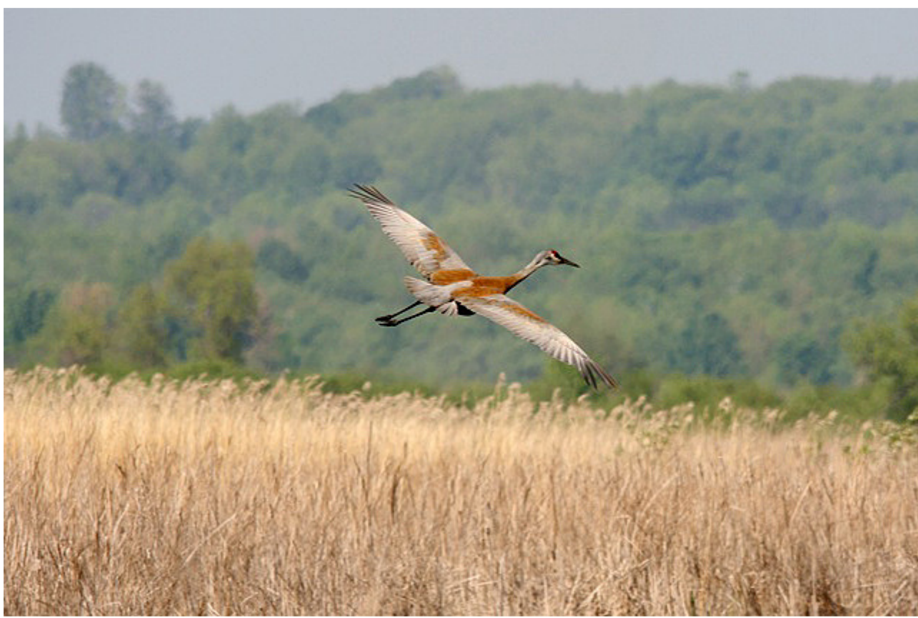
Figure 4. Sandhill Crane in flight, Ravenshoe Flats, York R.M. on 24 May 2010.

same date (Figure 4). Bruce Brydon returned on 25<sup>th</sup> to check on the birds, but only saw the two adults, while Marshall Folk also obtained photos on that date (Figure 5). To our knowledge, the family was last seen on 29 May 2010, by Roy Smith, Winnie Poon and photographer Marshall Folk. They were still in the same location on the dike forming the east bank of the Holland River where Kevin Shackleton had obtained his photos, but quickly moved north and hid in the tall riparian vegetation. It was not possible to photo-document the young that day, but a photo of one of the adults, taken by Winnie Poon, appeared in Toronto Birds 4(6):90, June 2010.