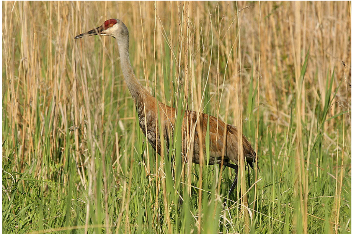
Figure 1. Adult Sandhill Crane at Ravenshoe Flats, York R.M. on 25 May 2010. [Note: This photo first appeared in West Humber Naturalists Club Newsletter, September 2010]

Returning the following day (23<sup>rd</sup> May) in company with Sean Macey, they first looked for the cranes where he had last seen them on the dike east of Yonge Street, but when their search proved unsuccessful they tried the western end of the dike, and were fortunate to relocate the family fairly close to the Holland River, about 500m west of where they had been the previous day. Bruce was not able to photograph the young at this time, but he did get a good shot of one of the adults, hiding in the rank vegetation, when he returned to check on the birds on 25<sup>th</sup> (Figure 1).