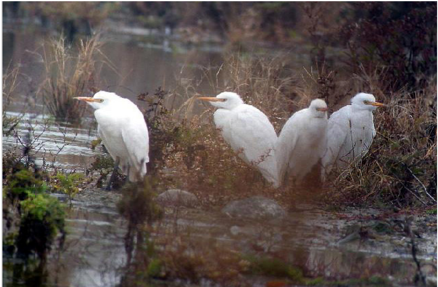
In mid-October, a surprise influx of Cattle Egrets occurred across southern Ontario. Sight reports indicated that as many as 29 birds could have been involved; most impressive was a group of 14 birds seen in Ottawa on 26 October. Pictured above are the four found by Dave Milsom at Bolton, Peel , on 24 October 2010. © Dave Milsom.