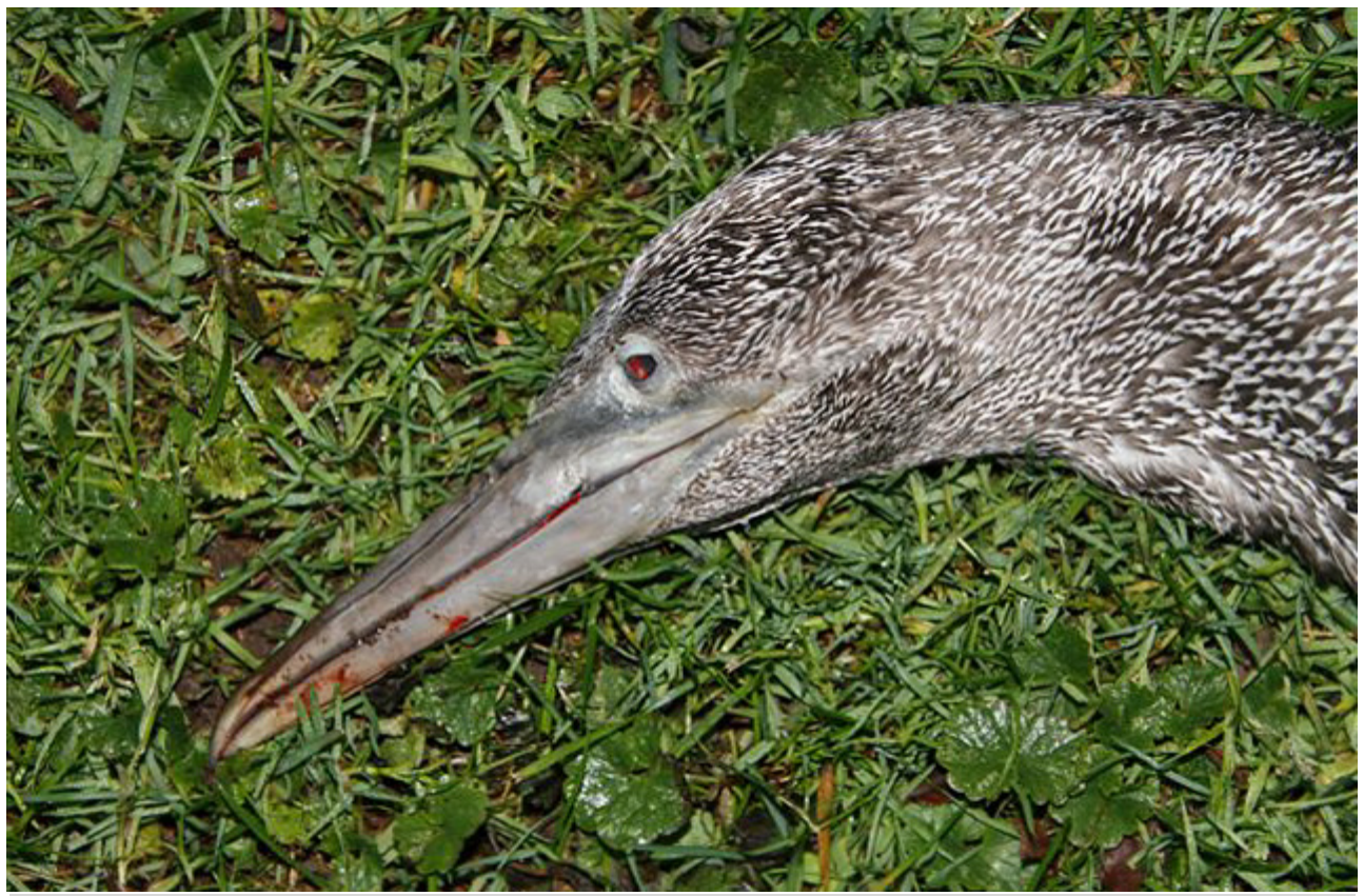
Head of juvenile Northern Gannet found at Hwy 2, Durham, 15 November 2010.