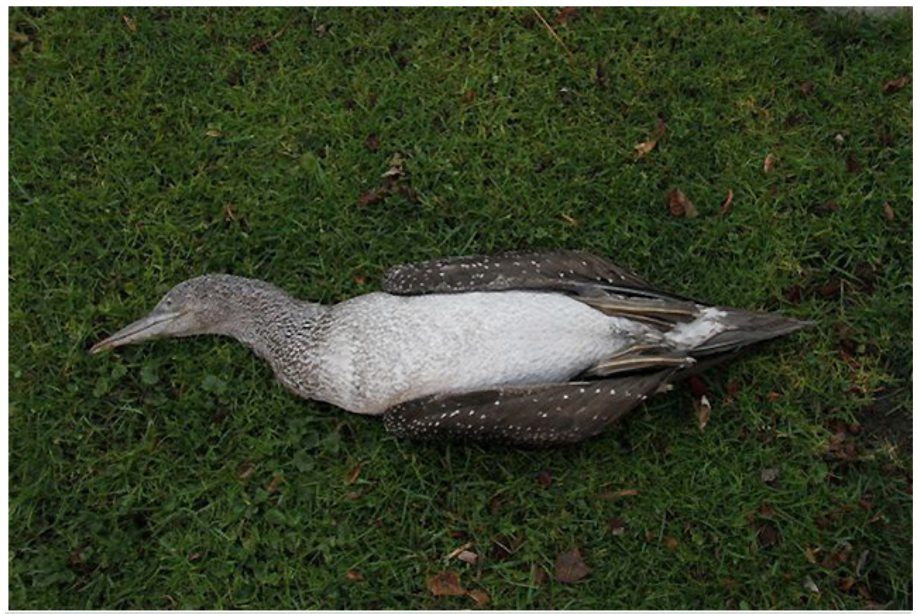
Juvenile Northern Gannet that crashed into a truck, was then hit by another car and died on Hwy 2, Durham , 15 November 2010. Anthony Wood, who witnessed the incident, recovered the dead bird and next day gave it to Jim Richards, who took these photos. The specimen was later delivered to the ROM.

NORTHERN GANNET – 1 at Tip, LSS at 14:05hrs on 13th (HC fide ONTBIRDS) & 1 at Toronto Harbour at 08:15hrs on 14th (Steve Charbonneau fide ONTBIRDS). 1 (assumed to be the same bird) was picked up dead at Lot 35, Conc 2, Clark Twp, Durham on 15th (A. Wood, fide JMR). While driving W on Hwy 2, Anthony Wood saw a large bird flying S, low over the fields. It crashed into the side of a truck and was still alive, sitting on the highway. It was hit by another car, died, and he recovered the specimen. This location is about 2km 'inland'. The specimen was received by JMR on 16th and transferred via GC to ROM. [Photos on file]. 1 IMM flying E at Lake Ontario off Cranberry Marsh, Durham @ 11:15hrs on 20th (anon fide RRP) & then seen at 11:30hrs flying E at Thickson's Bay, Durham (AEK,Tim Schneider, fide GCarp).