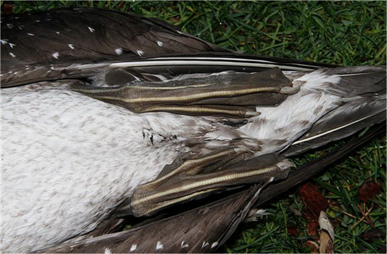
Vent area showing the webbed feet of the juvenile Northern Gannet killed at Hwy 2, Durham, 15 November 2010.